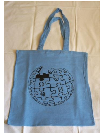
Figure 2 One of the new Wikipedia shopping bags

Work has been ongoing in February on replenishing our stock of Wikipedia themed merchandise. The items were ready by the end of March. Some of the new items include pins, shopping bags and yo-yos. The items will be used as give-aways at events and as prizes in our competitions.