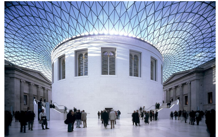
The Great Court at the British Museum