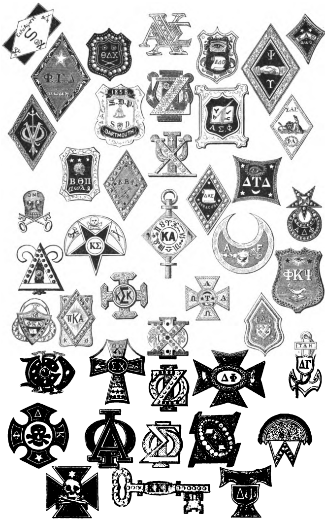
BADGES OF THE CHARTERED FRATERNITIES.