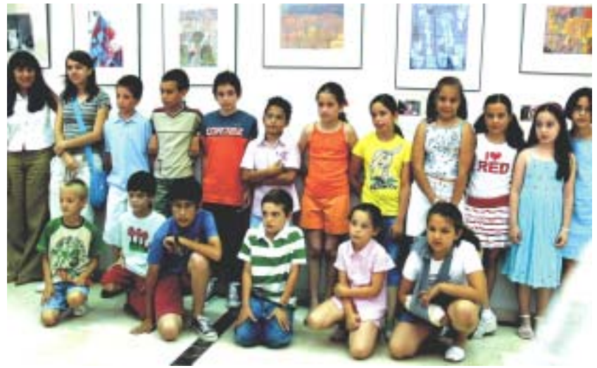
Photos from exhibition in Toledo / Spain – authors with friends and parents