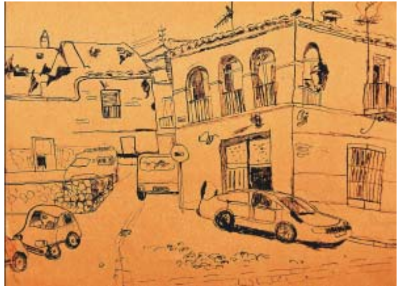
Toledo / Spain – the studio „Little masters“ – art teacher Rosa