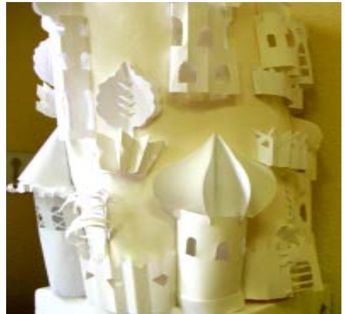
III Junior Delphic Games 2007, Bagio / Philippines