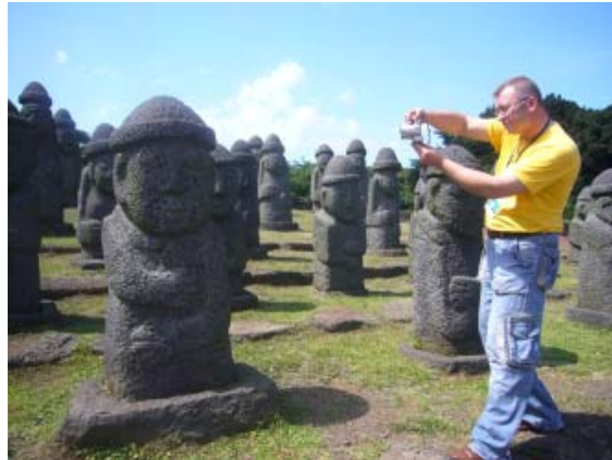
III Delphic Games 2009 for adults. Jeju / Korea. motto «In Tune with Nature»