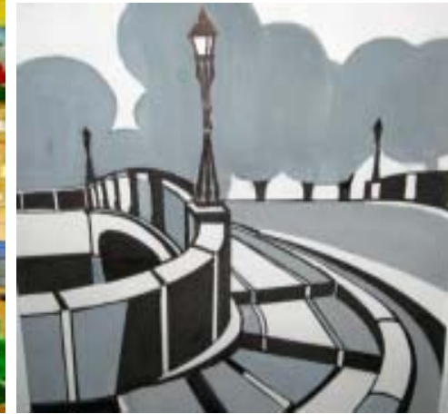
paintings and drawings from Saint Petersburg