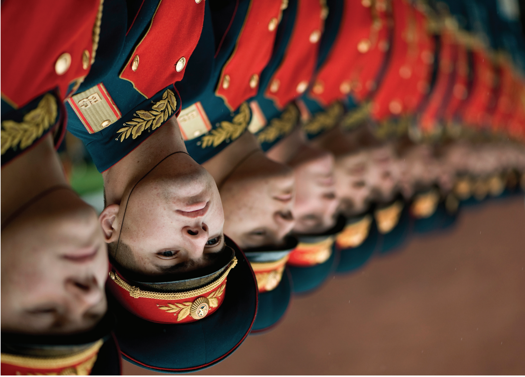
The Russian military honor guard welcomes U.S. Navy Adm. Mike Mullen, chairman of the Joint Chiefs of Staff, during a wreath-laying ceremony at the Tomb of the Unknown Soldier in Moscow, Russia, June 26, 2009.