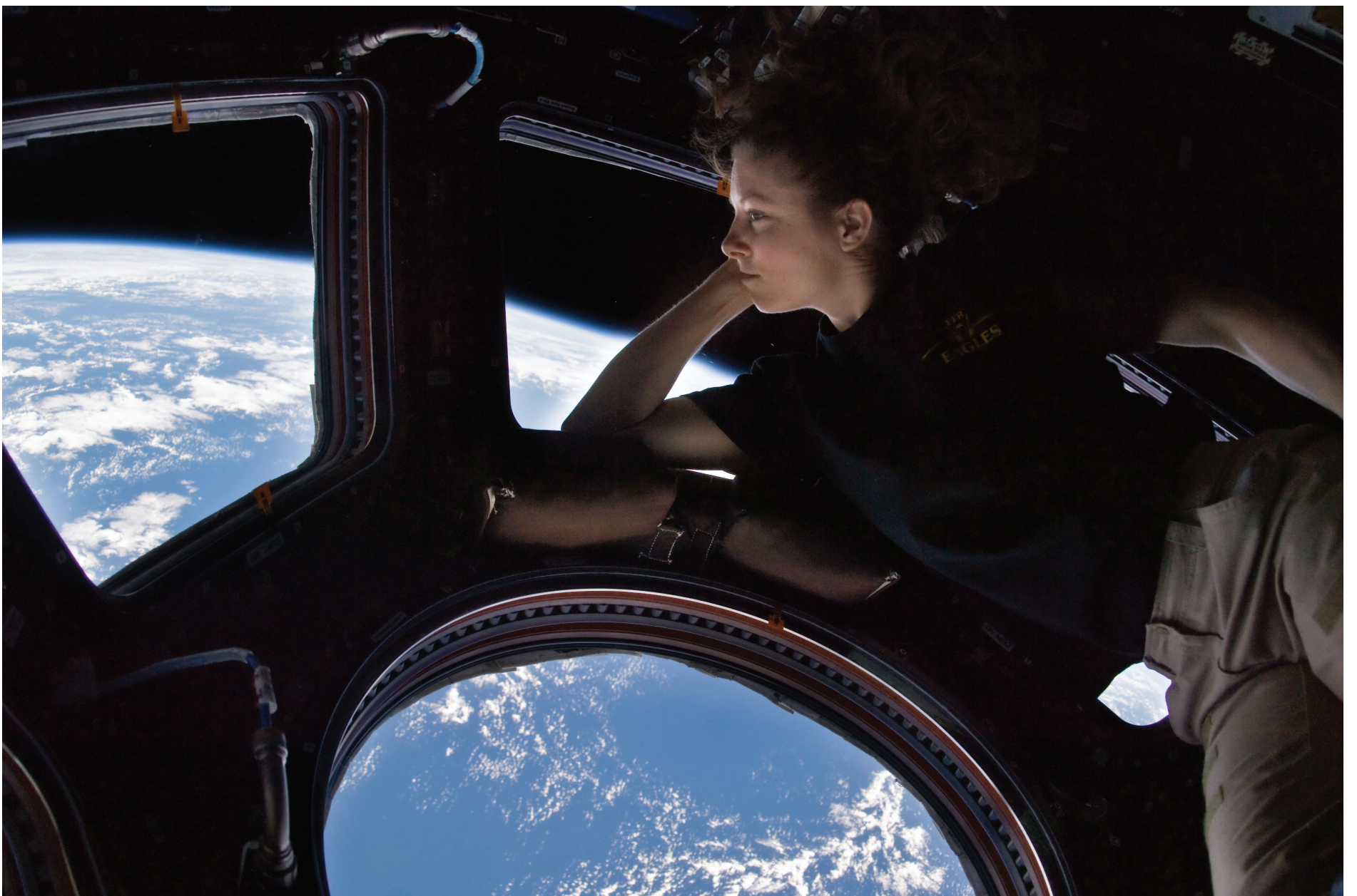
Self portrait of Tracy Caldwell Dyson in the Cupola module of the International Space Station observing the Earth below during Expedition 24

Tracy Caldwell Dyson, NASA Second place, 2011 Public domain (U.S. government work)