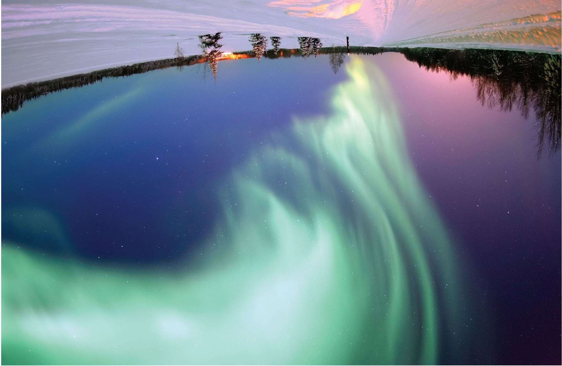
The Aurora Borealis, or Northern Lights, shines above Bear Lake, Eielson Air Force Base, Alaska