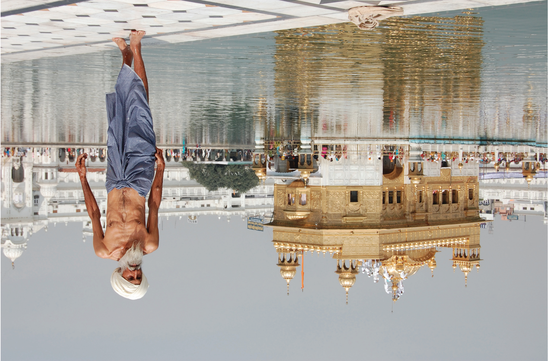
Sikh pilgrim at the Harmandir Sahib (Golden Temple) in Amritsar, India. The man has just had a ritual bath.

User:Paulrudd First place, 2009 CC-BY-SA 3.0 and GFDL 1.2+ File:Sikh pilgrim at the Golden Temple (Harmandir Sahib) in Amritsar, India.jpg at Wikimedia Commons