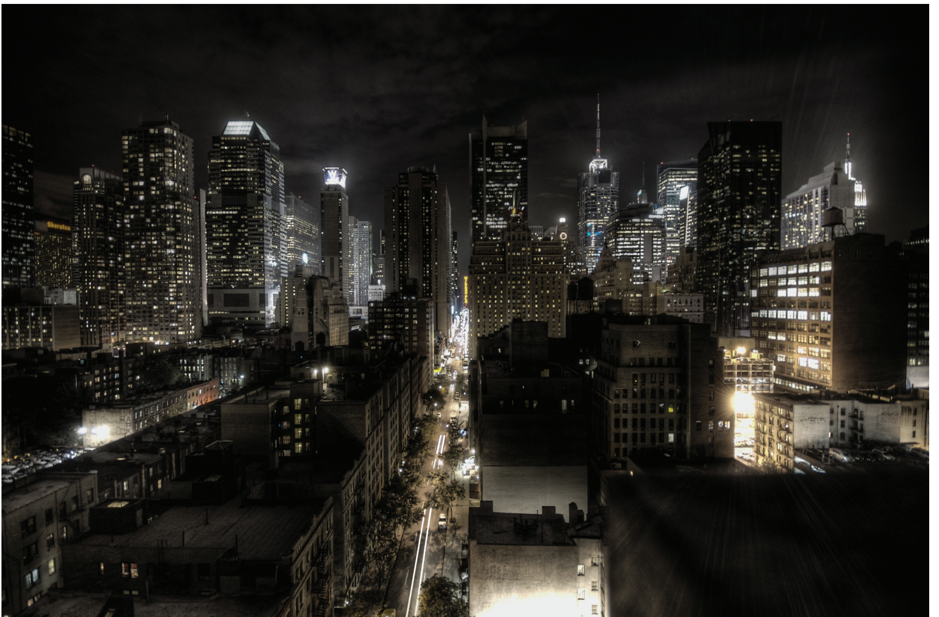
New York City at night, photographed using the High Dynamic Range technique

Paulo Barcellos Jr. on Flickr Second place, 2007 CC BY-SA 2.0