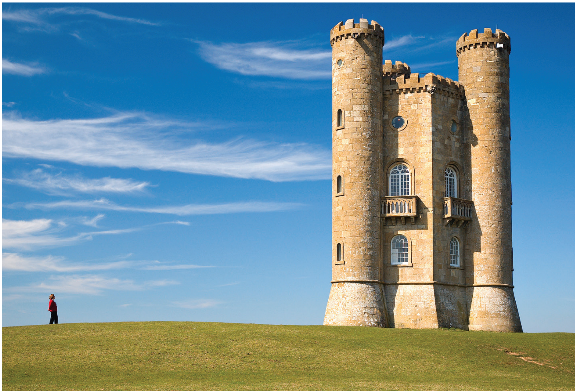
Broadway Tower in Cotswolds, England

User:Newton2 First place, 2007 CC-BY 2.5