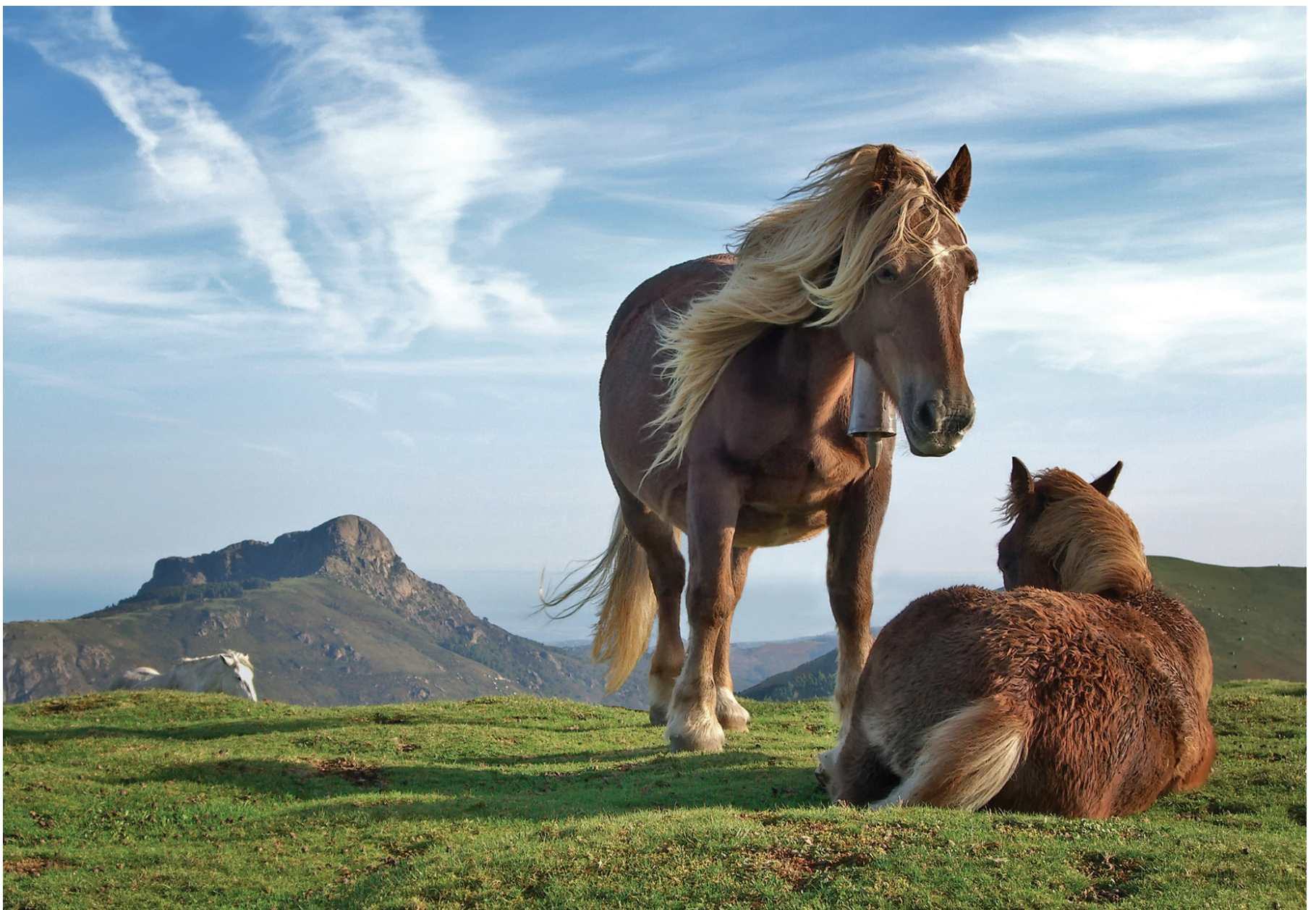
Horses on Bianditz mountain, in Navarre, Spain. Behind them the Aiako mountains can be seen

Mikel Ortega on Flickr First place, 2008 CC BY-SA 2.0