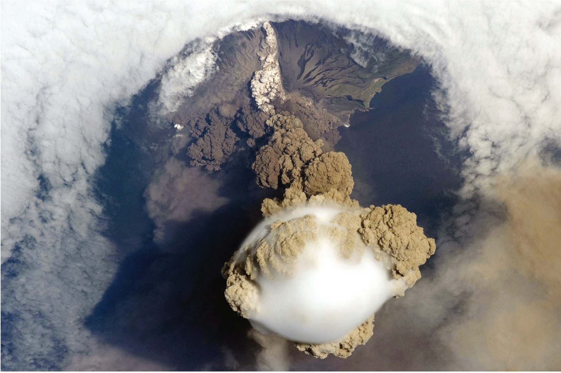
Sarychev Peak Volcano erupting on June 12, 2009, on Matua Island