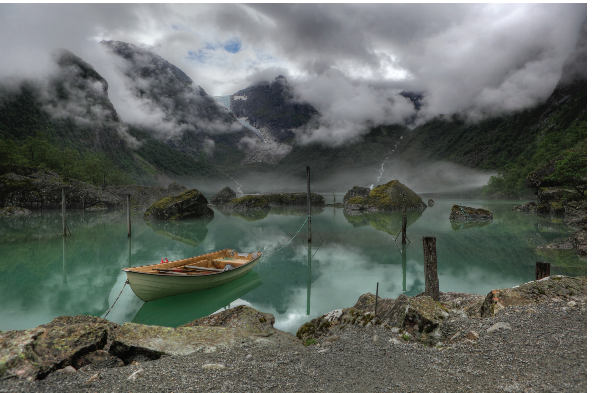
A view of Lake Bondhus in Norway, and in the background of the Bondhus Glacier, part of the Folgefonna Glacier

Heinrich Pniok (User:Alchemist-hp) First place, 2011 Free Art License