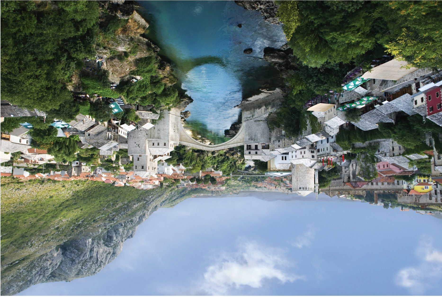
Mostar - Old Town panorama. The picture was taken from the minaret of Koski Mehmed Pasha Mosque , which is just opposite Stari Most ("The Old Bridge") looking on the same part of the Neretva river.

User:Ramirez Second place, 2010 CC-BY-SA 3.0 and GFDL 1.2+