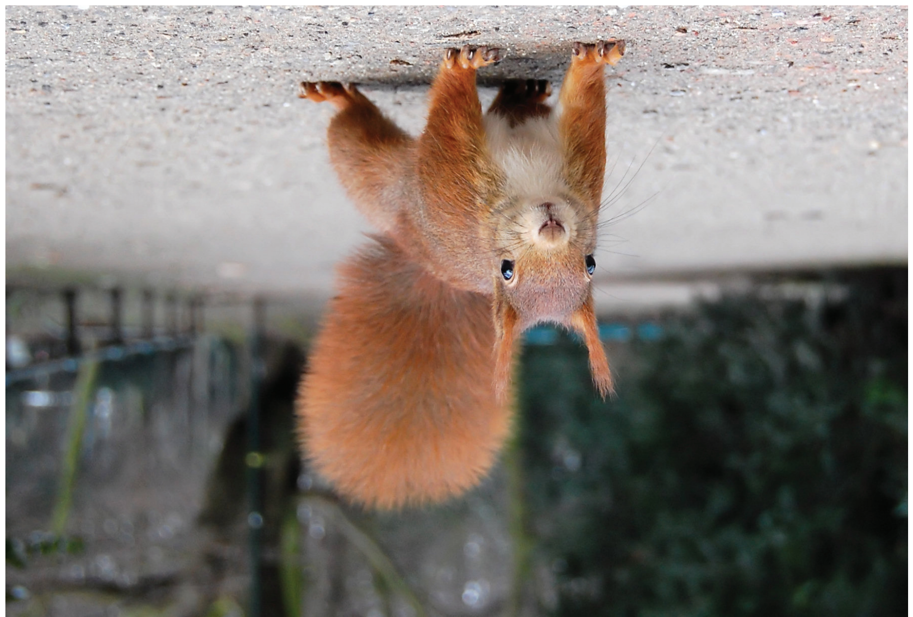
Red Squirrel with pronounced winter ear tufts in the Hofgarten in Düsseldorf, Germany

User:Ray eye Third place, 2007 CC BY-SA 2.0 DE