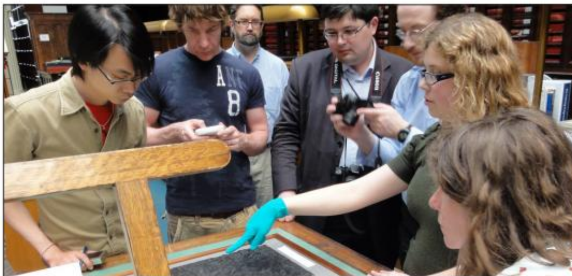
British Museum's Assistant Keeper of Dutch and Flemish prints and drawings, with Wikipedians examining a Dürer print block

The GLAM-Wiki initiative (Galleries, Libraries, Archives, Museums with Wikipedia) helps cultural institutions share their resources with the world through high-impact collaboration alongside experienced Wikipedia editors. It is an unparalleled opportunity for the custodians of our cultural heritage to present their collections to new audiences.