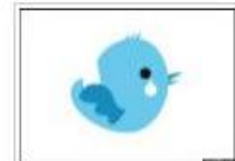
RANKED: The 9 Least Retweetable Words