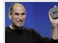
Apple TV Review 2010: Critics Go Hands On With...