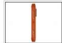
PHOTOS: Nokia's Flagship Phone Set For Release