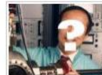
Inventors Hall Of Fame 2010: See The New Inductees