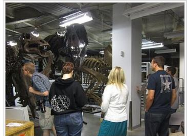
Wikipedians behind the scenes at The Children's Museum of