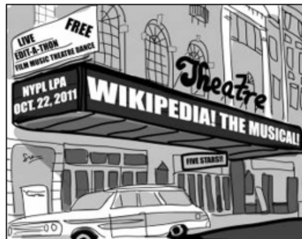
Poster art promoting NYPL's editathon. Art by Lauren Lampasone

The notion that the research efforts of a group of people with varying opinions, when aggregated, can result in better information than a specific expert could come up with—aka “crowdsourcing”—has been around for some time. It’s one of the ideas on which the 10-year-old Wikipedia is based. So it seemed only natural when