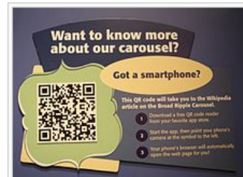
A label in The Children's Museum of Indianapolis that uses a QRpedia code to direct visitors to the Wikipedia article " Broad Ripple Park Carousel "