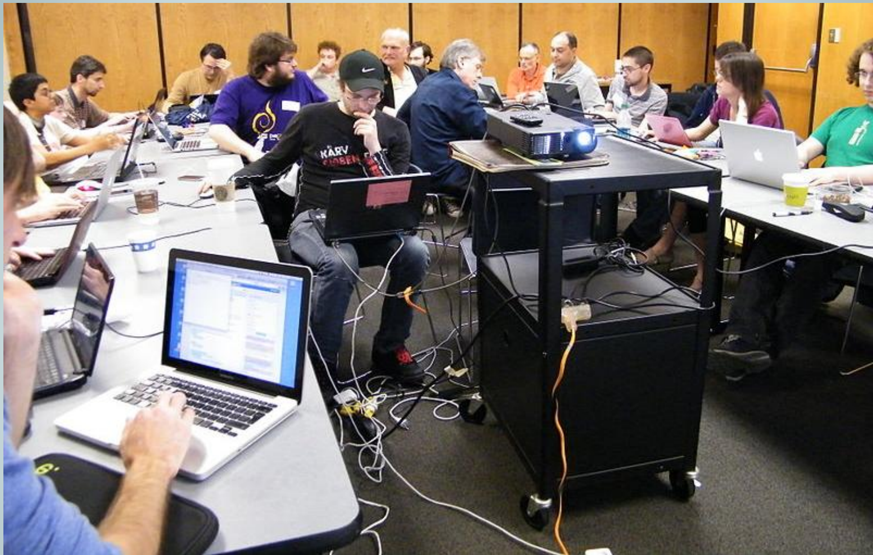
GLAMcamp New York | Spring 2011