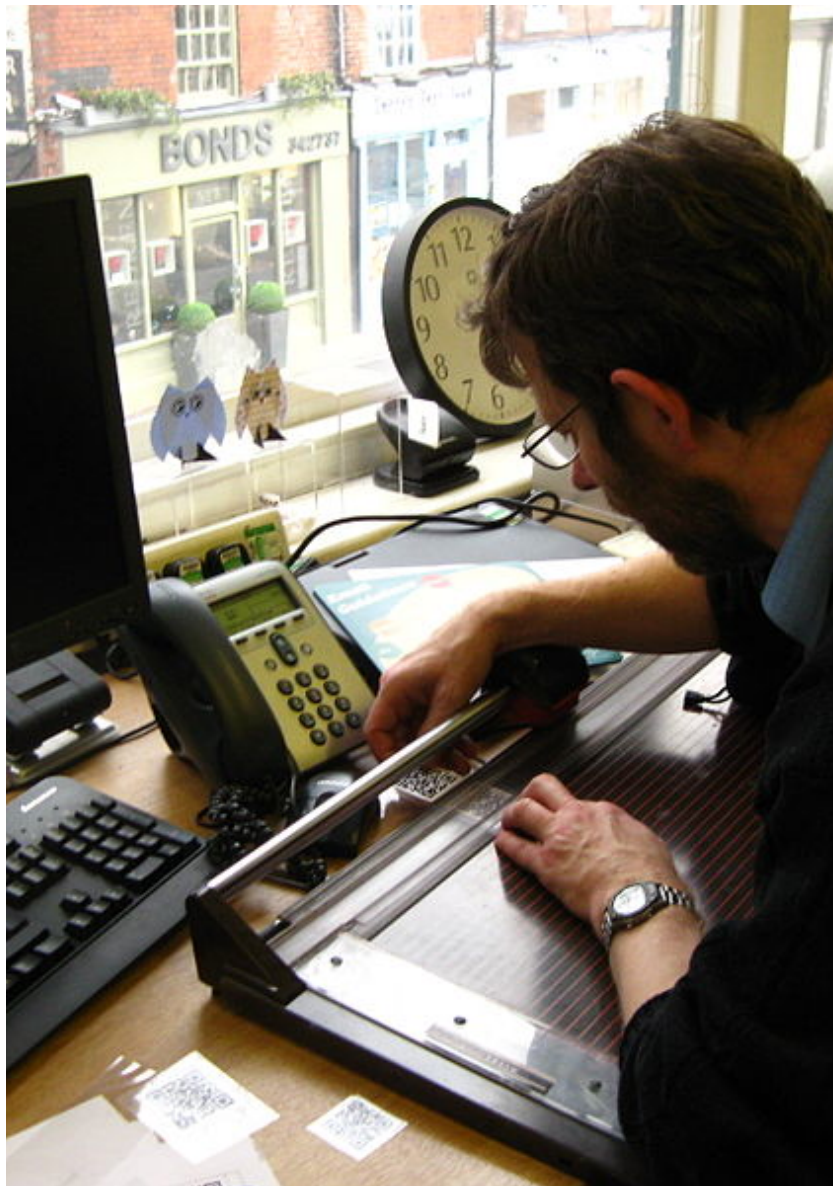
QR Code experiment at Derby Museum, which allows visitors to access Wikipedia using smart phones. This file is licensed under the Creative Commons Attribution-Share Alike 2.0 Generic license. http://commons.wikimedia.org/wiki/Image:QRCode_prep_at_Derby_Museum.jpg

QR Codes are similar to UPCs: Both can be read by scanners and contain coded information. Many people have smart phones, which can be used read QR Codes. Some museums around the world, such as the Derby Museum, are using QR Codes to help extend knowledge sharing about materials on display in their collection. They create codes with URLs in them, with the URL linking to the related Wikipedia page. Visitors can then scan the relevant codes and learn more about the items on displays.