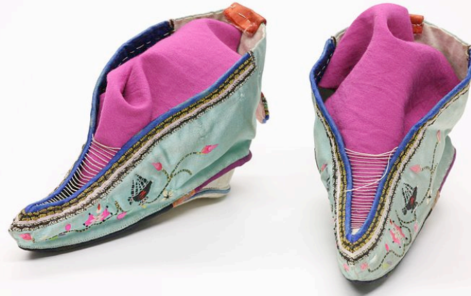
Foot binding shoes, an image taken by Daniel Schwen at the Children's Museum Backstage Pass event, chosen as Featured picture. This file is licensed under the Creative Commons Attribution-Share Alike 3.0 Unported license. http://outreach.wikimedia.org/wiki/File:Foot_binding_shoes_1.jpg