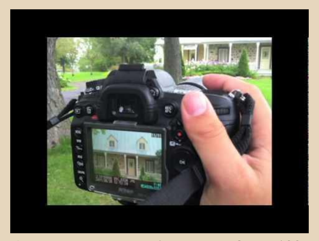
Capture from video

Our first experience, no chance to innovate. We chose to follow what was done before.