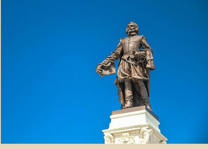
Pierre-Olivier Fortin CC-BY-SA 3.0