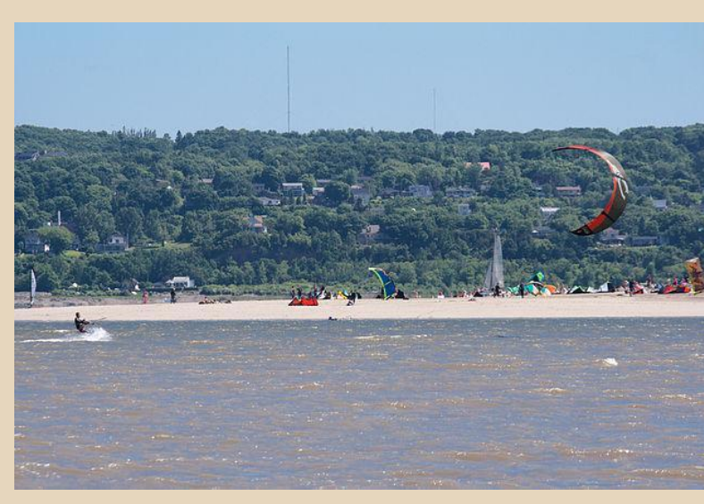
Jean-Sylvain Tremblay, CC-BY-SA 3.0