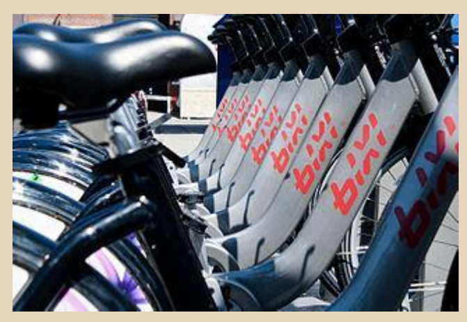
Jean-Sylvain Tremblay, CC-BY-SA 3.0