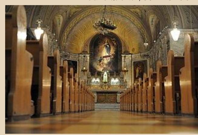
The winning picture from Montreal