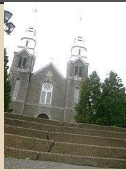
Melanie Quienton, CC-BY-SA 3.0