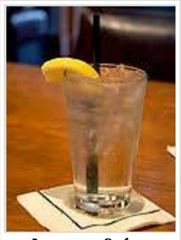
el agua fría – the cold water