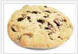
la galleta – the cookie