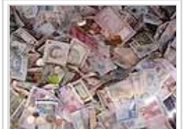
rico/rica – rich