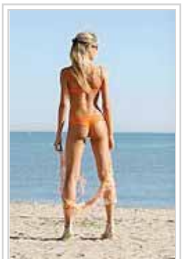
caliente – hot