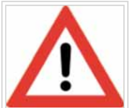
¡cuidado! – be careful