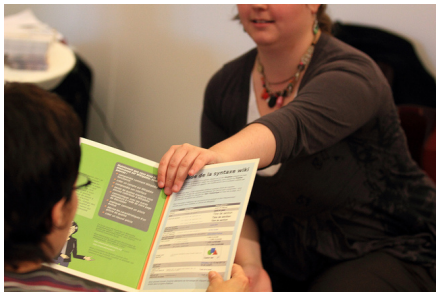
Handing out a bookshelf La Novela - Toulouse

Work with people you know! (not formal partnership)