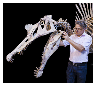
Didier Descouens Museum de Toulouse Didier Descouens (CC-BY-SA-3.0)