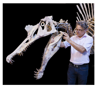
Didier Descouens Museum de Toulouse Didier Descouens (CC-BY-SA-3.0)