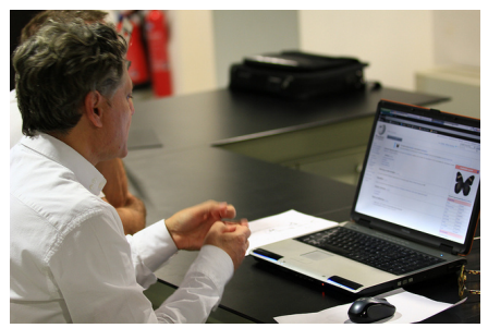
Tutorial on Wikipedia/Commons and Phoebus project Muséum de Toulouse