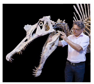
Didier Descouens Museum de Toulouse Didier Descouens (CC-BY-SA-3.0)