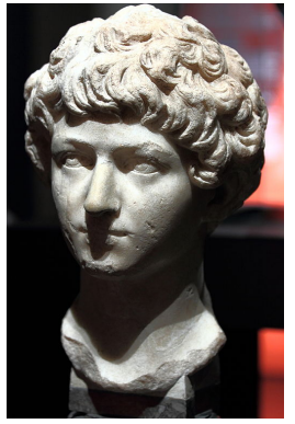
Lucius Verus Musée Saint-Raymond - Musei Capitolini PierreSelim (CC-BY-SA-3.0)