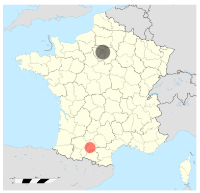
Map of France (regions and departement) Wikimedia Commons Eric Gaba (CC-BY-SA-1,2,2.5,3)