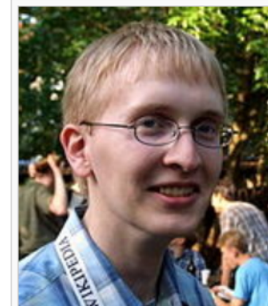
OH GOD MY EYES