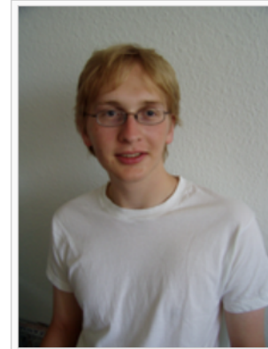
The most nerd like admin of all, who is also a nazi.