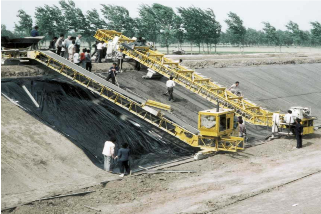
Lining of Rainee Canal, Sindh-Pakistan.