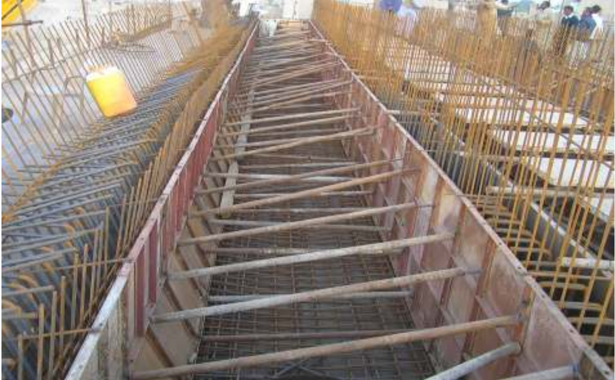
Leyari Expressway, Sir Shah Suleman Interchange, Grid 1 to 2, South Bound Box Girder, Form Work (Karachi-Pakistan)