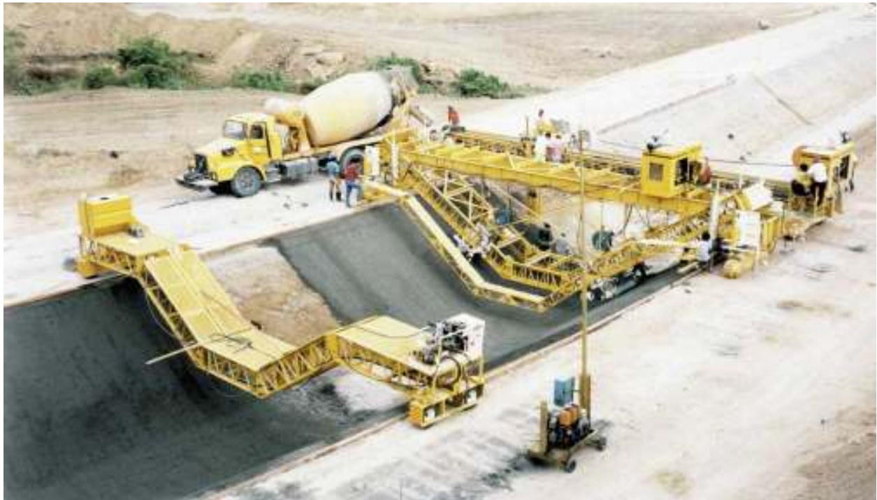
Rainee Canal Project, Lining of Canal. Sindh-Pakistan