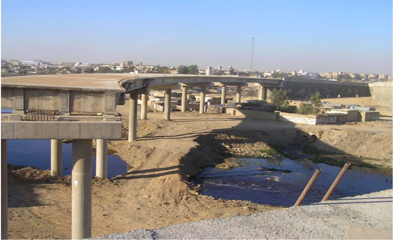
Leyari Expressway, Sohrab Goth North Bound Structure (Karachi-Pakistan)