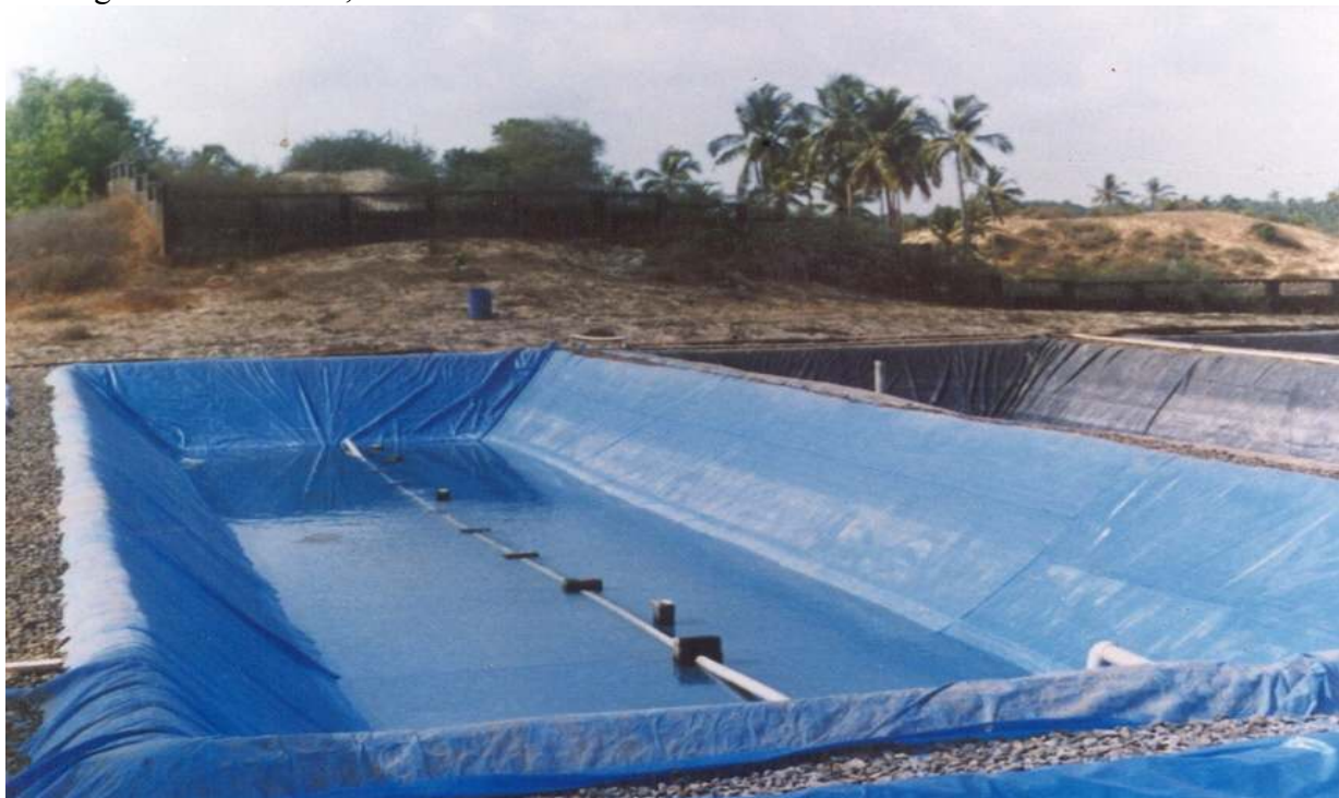
Water Reservoir at Rainee Canal. Sindh-Pakistan Sultan Mahmood and Company Engineers and Contractors