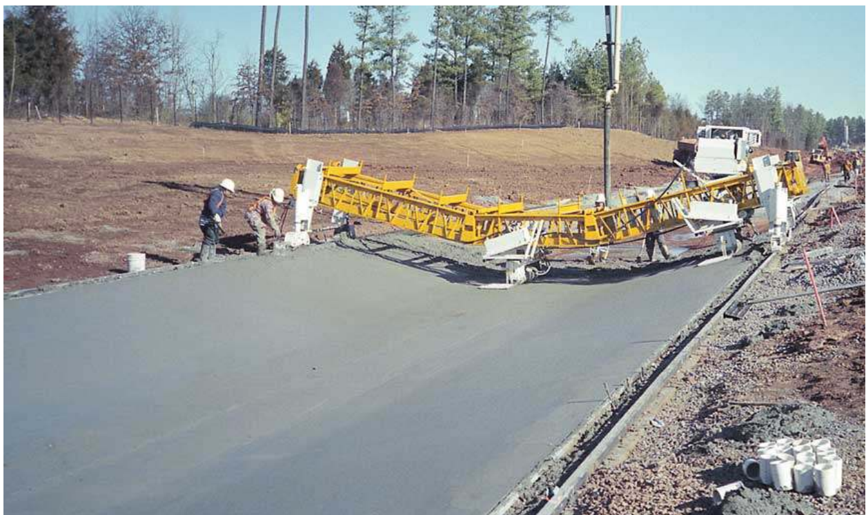
Rainee Canal Project, Lining of Canal, Sindh-Pakistan