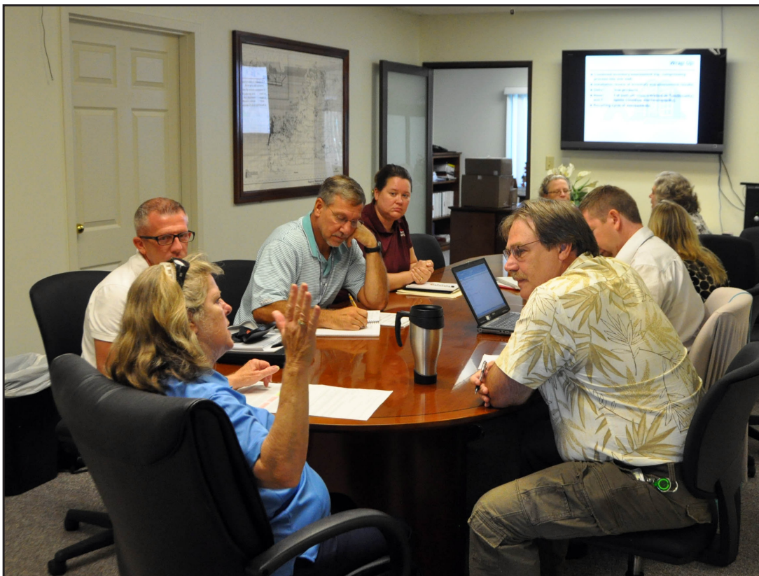
Members of Housing Assessment Team gather to discuss plans prior to conducting an inventory of accompanied and unaccompanied housing at the installation.

■ Sailor Of The Week Because: For an outstanding performance during the coordination of office movement as construction concluded on the second wing of Bulkeley Hall