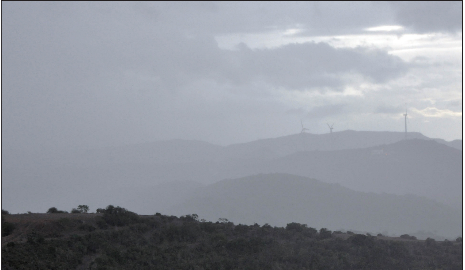
Tropical Storm Isaac makes landfall at Naval Station Guantanamo Bay, Aug. 25. Condition of Readiness (COR) level 3 was set base wide in preparation for Isaac, Aug. 23.