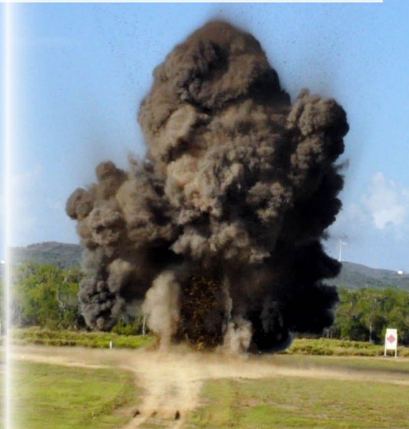
Composition C-4 is detonated at NS Guantanamo Bay's explosive ordnance disposal (EOD) range as the installation's Weapons department detonates ammunition with an expired 'shelf-life,' Aug. 29. Approximately 60 satchels of unusable C-4 totalling 1,160 pounds of net explosive weight was detonated during the two-day evolution.