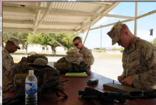
Marines inspect their gear and count ammunition after coming off duty, Aug. 16.