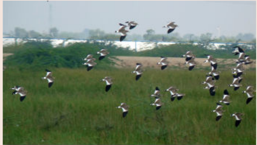
A flock of Sociable Lapwings sighted near Ahmedabad

BirdLife is conducting a radio-tagging study of the Sociable Lapwings to understand the migration route of the birds from their breeding grounds in Eastern Kazakhstan to its wintering grounds. The tagged bird named 'Dinara' was traced close to the city of