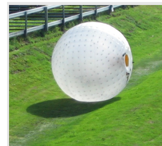
Photo of a zorb in action.

The records were part of worldwide attempts, to commemorate the second annual Guinness World Records Day. Guinness officials were on hand to monitor attempts in Australia, Canada, South Africa, New Zealand, USA, China, Sweden, Norway, Italy, Germany and France.