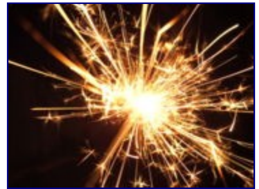
Violent reaction of sparkler.

Since that time, Guy Fawkes day is celebrated by bonfires, fireworks and the parading of effigies called "guys".