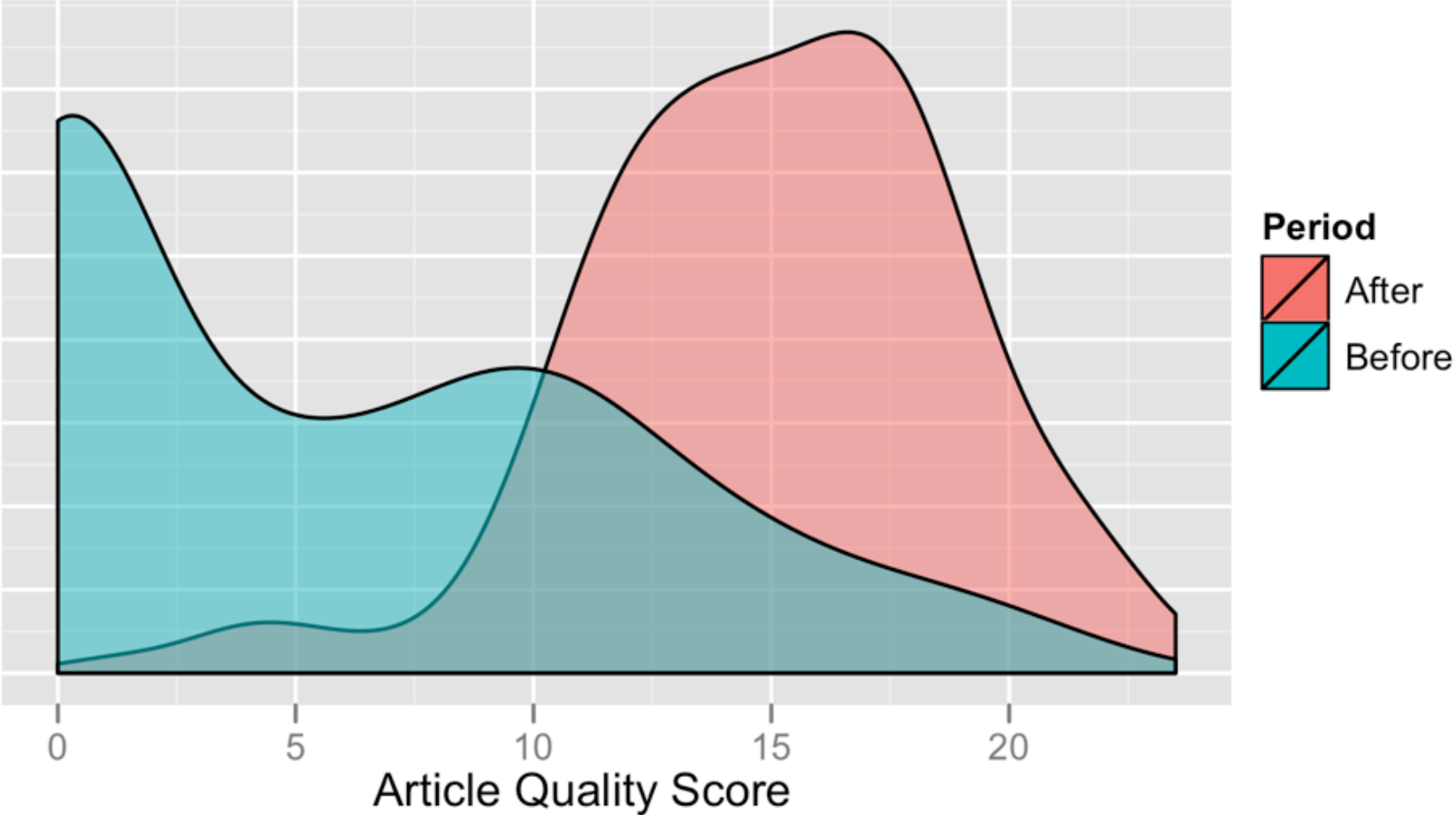
Article Quality Before and After Student Assignments