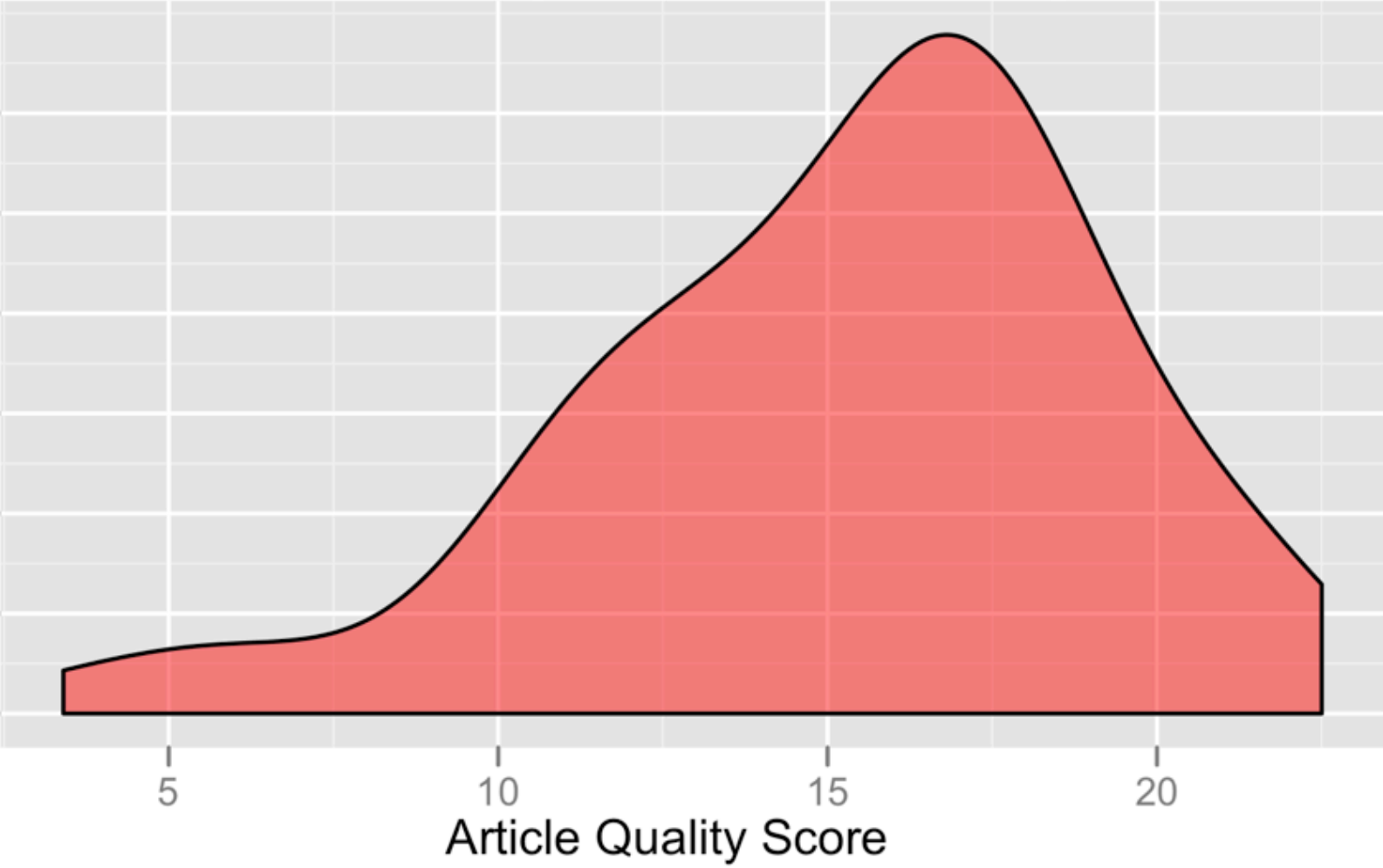
New Article Quality After Student Assignments