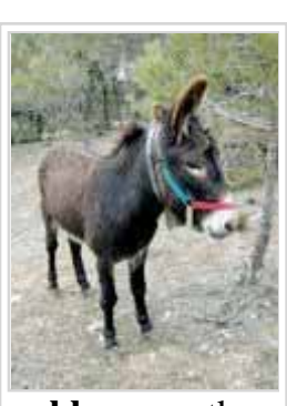
el burro – the donkey