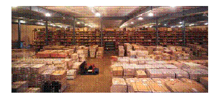
Indoor application & Open Space Area