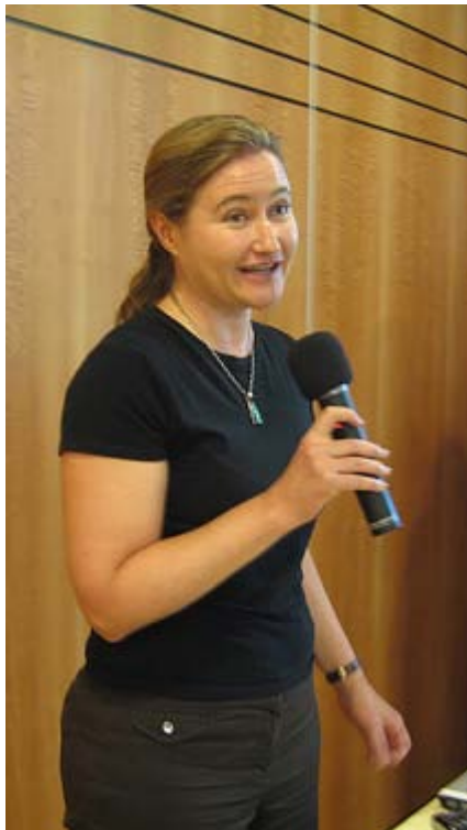
2007 CC-BY-SA-NC work by Charles Mok