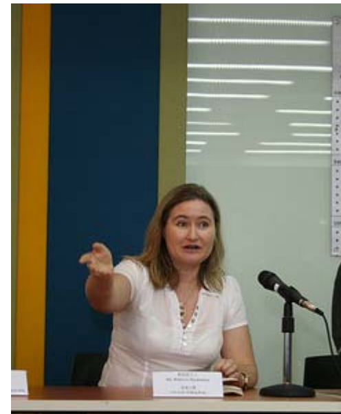
2008 CC-BY-SA-NC work by Sam Hau