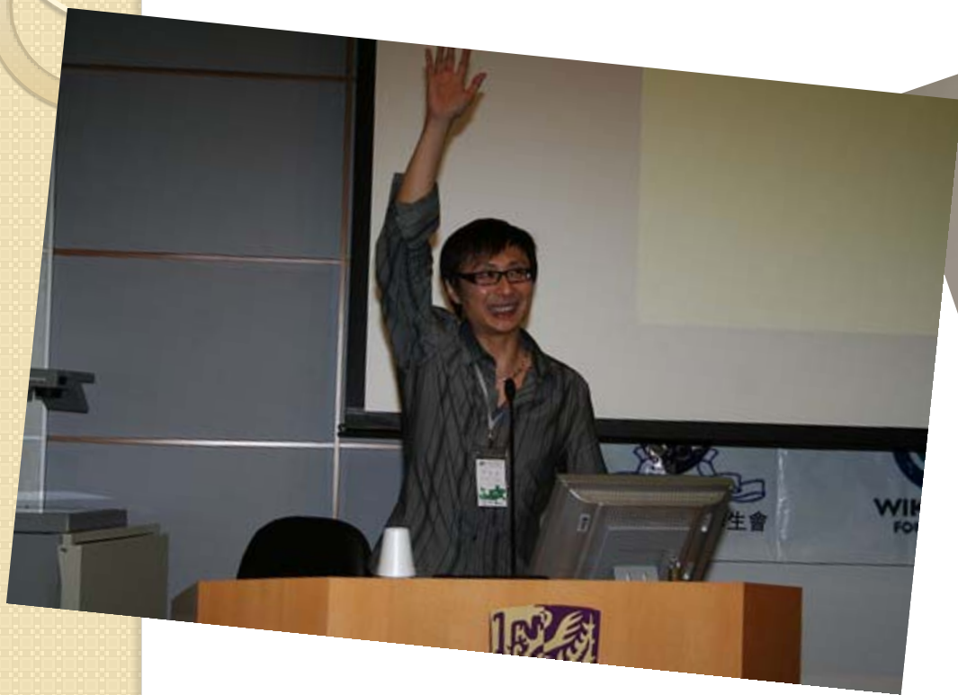
2006 Copyrighted work by Chitat Chan