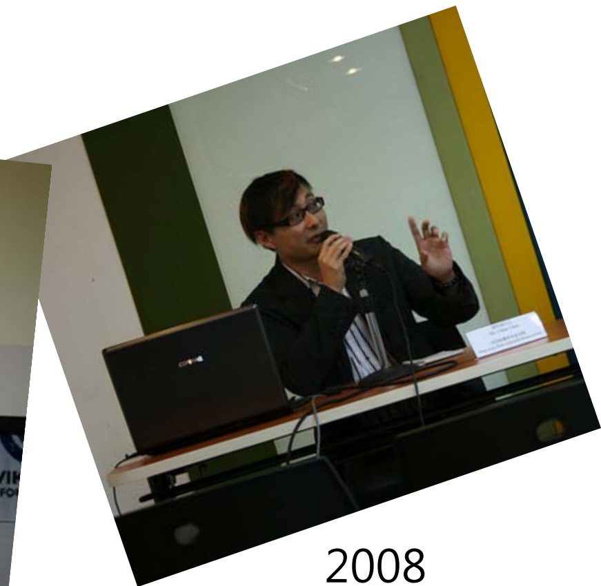
2008 CC-BY-SA-NC work by Sam Hau