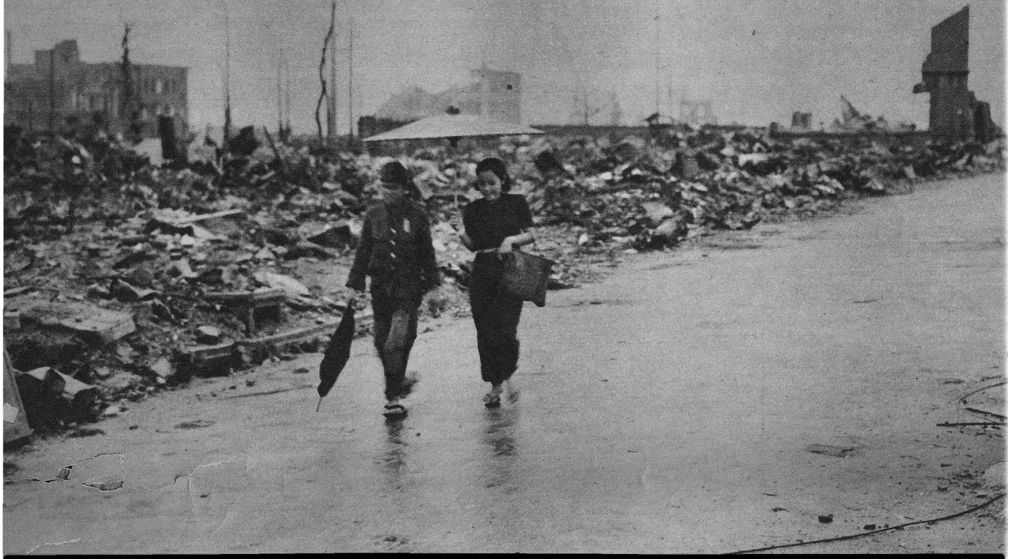
Two Japanese civilians walk on a road cleared through the dead ruins of Hiroshima. For four square miles the city was left in total destruction by the atomic bomb.

H IROSHIMA—In the bombed-out cities of Europe there were always plenty of eyewitnesses who were only too eager to tell you exactly how it was the day their house fell in. It wasn't like that in Hiroshima when I came here with the first group of Americans to enter the city since it was almost completely destroyed by our atomic bomb on Aug. 6. For the first two hours, as we walked through the utterly demolished downtown section, we couldn't find a single Jap on the streets who had been here when the bomb landed. Practically all eyewitnesses seemed to be dead or in the hospital.