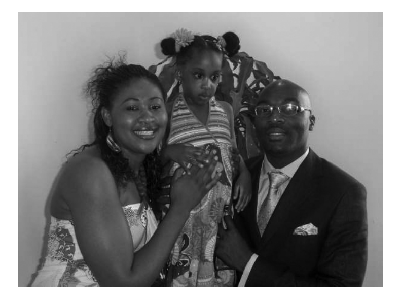
One Love, One Hope; strengthens families against cancer

Access to these drugs, increasing awareness, more cancer screening, and the HPV and HBV vaccines can drastically reduce the amount of cancer patients in Africa and other developing continents.