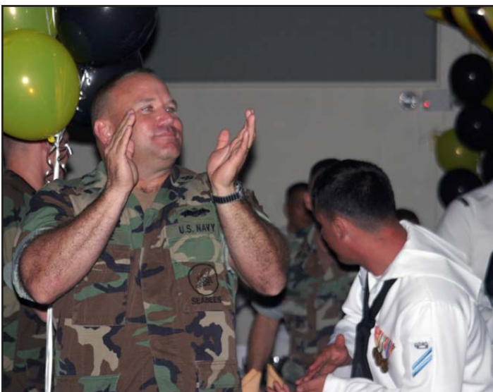
In contrast to the hard work and long hours characteristic of a deployment, Seabees from NMCB 75 partied the night away along with those Seabees stationed in GTMO, in honor of 66 years of service.

The Seabees continue to demonstrate their skills as Sailors and builders and approach every tasking with their 'Can Do' motto.—