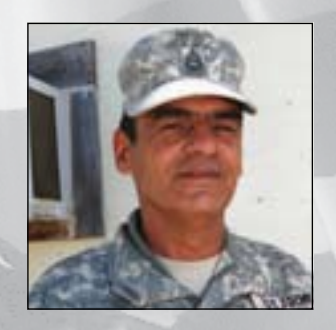
"In 2002 I was here and there a lot of good movies. But I haven't seen anything yet this year."