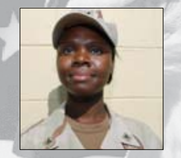
"'Madagascar.' I like it. It made me laugh."