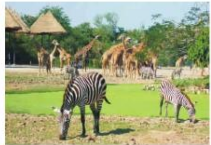
Safari World Park