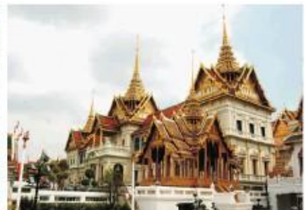
Grand Palace of Bangkok