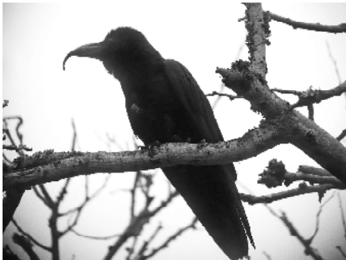
3. Large-billed Crow with elongated and down curved bill