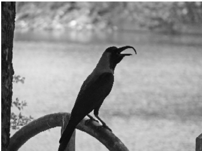
1. House Crow with elongated and down curved bill