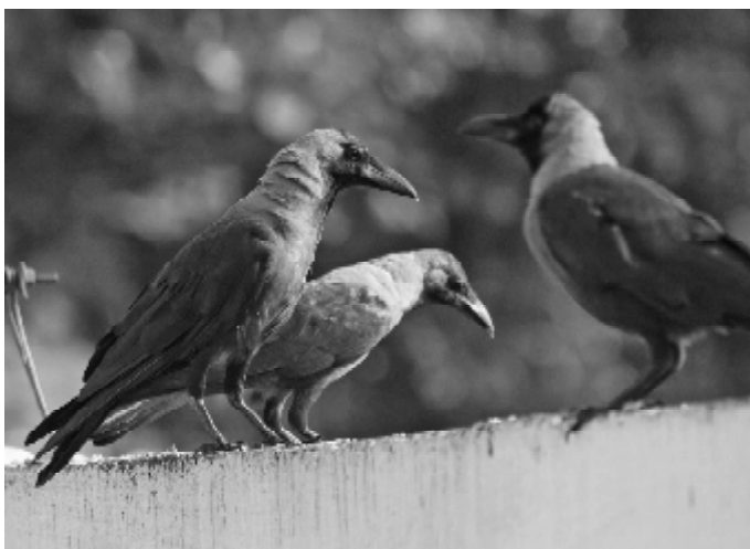
2. Two House Crows with hooked bills