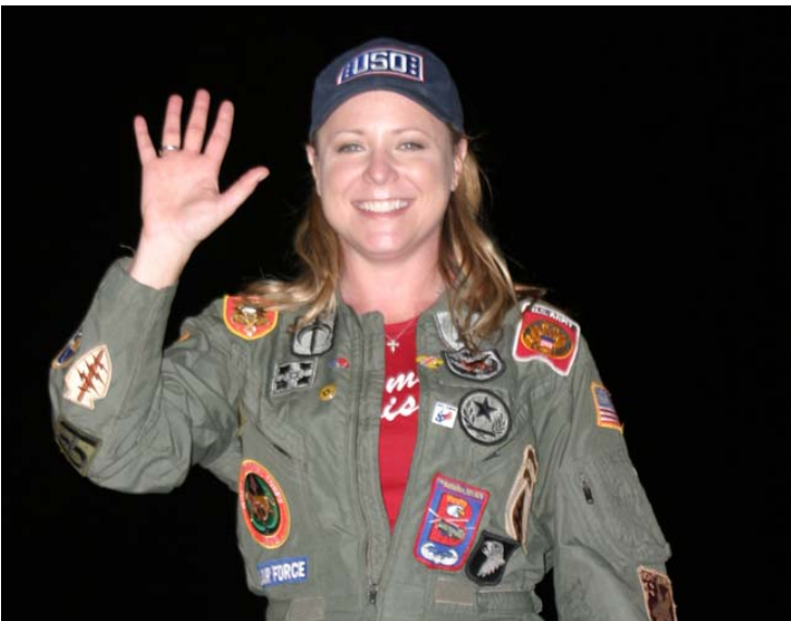
Big supporter — Actress Karri Turner, best known for her role as “Lt. Harriet Sims” on the long-running television series “JAG.” Among many other acting roles, Turner has appeared on the NBC TV series “Heroes” and will appear in the upcoming Steve Carell movie, “Get Smart,” scheduled for 2008 release. Turner has gone overseas to perform at military bases in Iraq, Afghanistan, Uzbekistan, Kuwait and Korea. She’s also been a frequent visitor at military hospitals around the country.