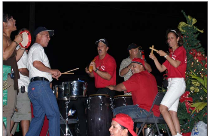
Feliz Navidad — The GTMO Latino Group is always a hit when they go through the parade route singing and playing music. La Navidad (latín: nativitas, ‘nacimiento’) es una de las fiestas más importantes del Cristianismo, junto con la Pascua y Pentecostés, pues celebra el nacimiento de Jesucristo. “La Posadas,” the remarkable buildup to Christmas Eve, is perhaps the most delightful and unique Mexican tradition. Beginning Sun. December 16, it commemorates the events in the journey of Mary and Joseph from Nazareth to Bethlehem.