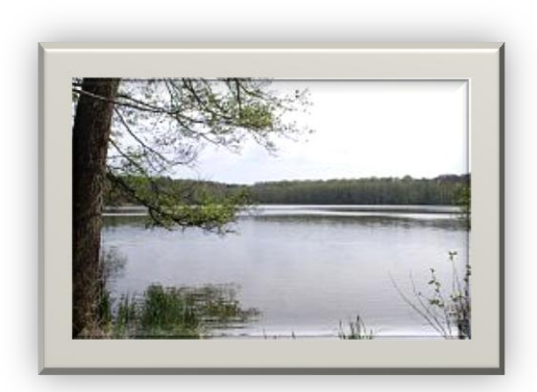
By Kds11, CC-BY-SA-3.0

Götz, Landgasthaus cc-by-sa 3.0, Erdmann99