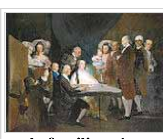
la familia – the family