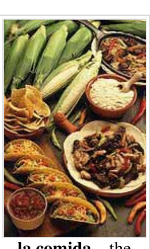
la comida – the food