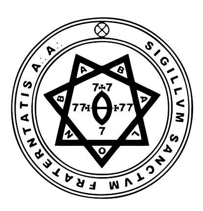
A:.A:. Publication in Class A.