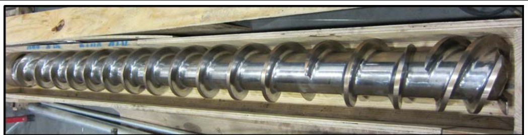
7.5 inch (190mm) diameter extrusion screw with bronze coated flights from DEMACO.

In a well-functioning extruder, the screw and cylinder barrel achieve good dough flow in the form of a dough rope. When the dough balls or “crumbles” enter the cylinder from the mixer, they compact to form a viscous rope. As the screw rotates, it transports the dough rope in the space or “cavity” created between the screw flights and the inside wall of the cylinder barrel. The dough rope winds around the screw root and the screw flight pushes the dough rope forward towards the die. As the rope hits the die, the dough becomes compressed as its flow becomes obstructed. Essentially, the free flowing dough rope hits a wall (die) with tiny holes (die inserts). The viscous dough resists flow through the die inserts and becomes compressed against the die. As the screw continues to push the dough rope forward, the compression increases and creates pressure. As the pressure mounts, the screw eventually presses the dough through the die.