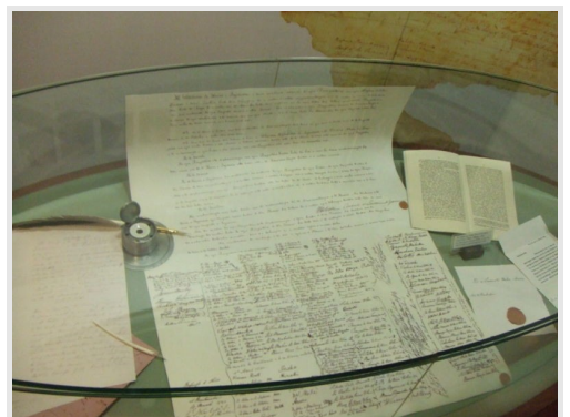
museum on the Waitangi grounds

Peter Dunne said: "The timing is right employer. for New Zealand to actively and positively advance our national identity – starting with a new national day." He claims quite a lot of support