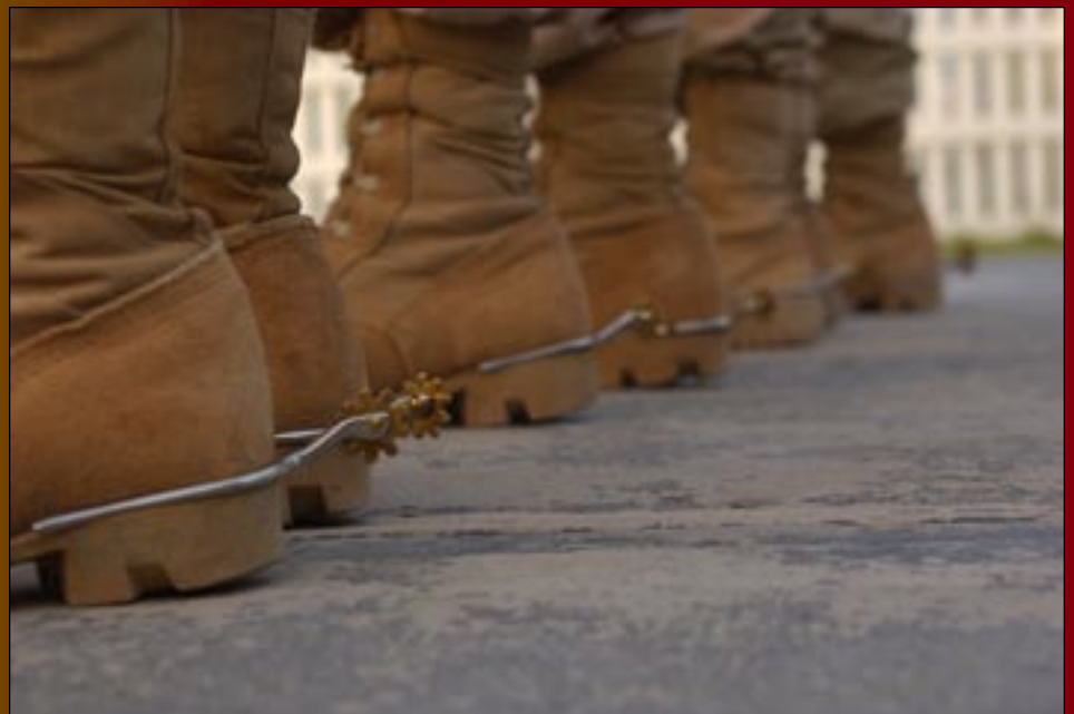
▲The new knights show off their spurs.