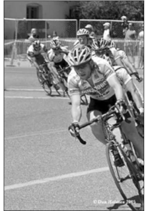
Lance Armstrong led the pack in order to secure his seventh Tour de France victory.

Armstrong has more than cycling in his life. He founded the Lance Armstrong