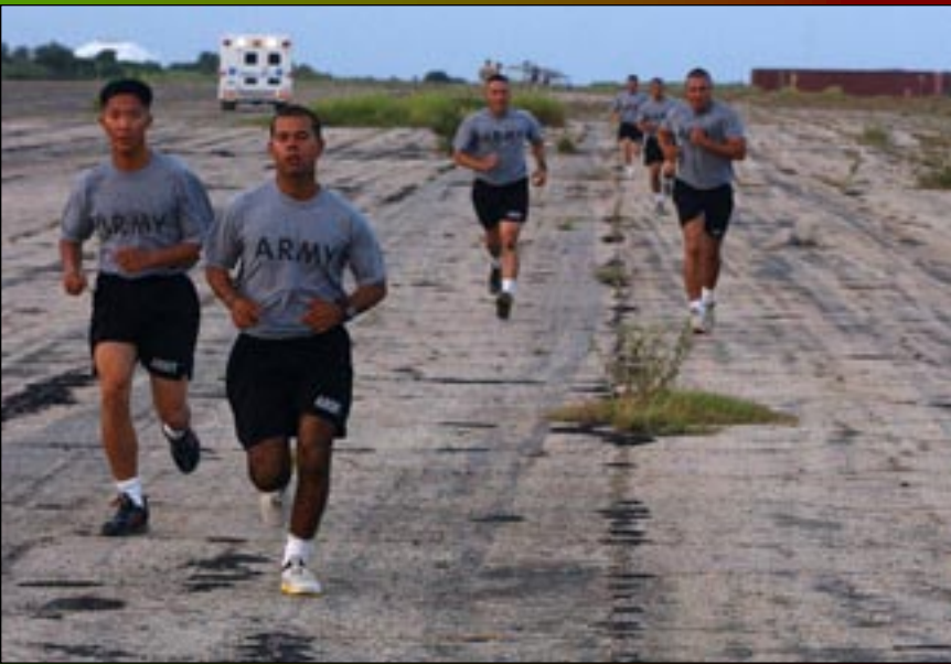
▲The “shave tails” give their all during the run portion of the APFT.