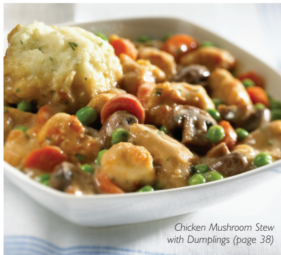
Chicken Mushroom Stew with Dumplings (page 38)