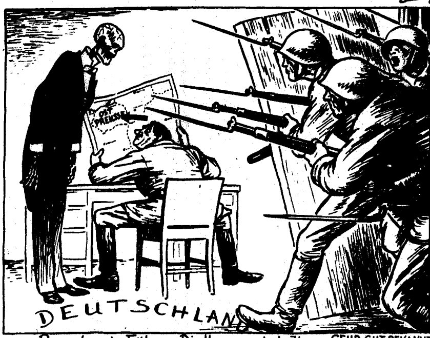
Besuch mein Führer. Die Herren sind Ihnen SEHR GUT BEKANNT!