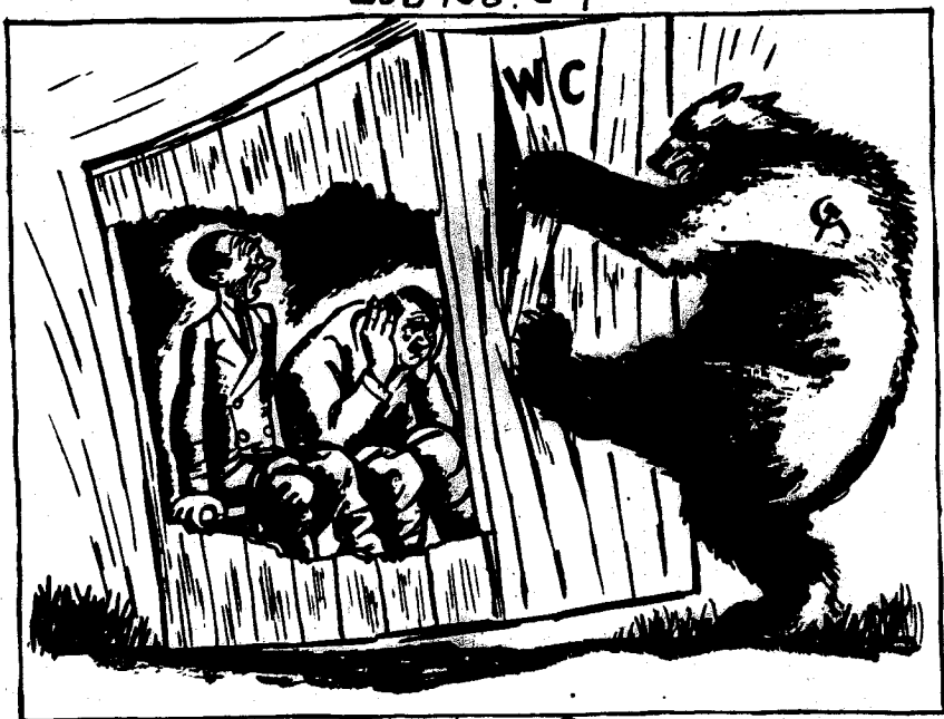
Volk ohne Raum