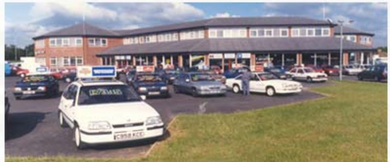
Unit Export (Great Britain) Ltd was renamed Unit Export Ltd.