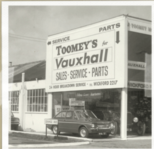
J Toomey Motors Wickford Circa 1969