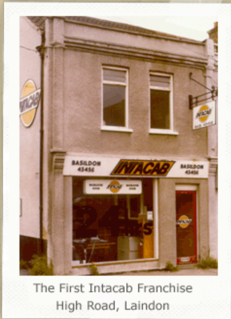
The First Intacab Franchise High Road, Laindon