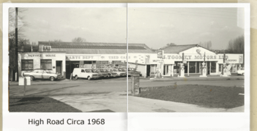
High Road Circa 1968