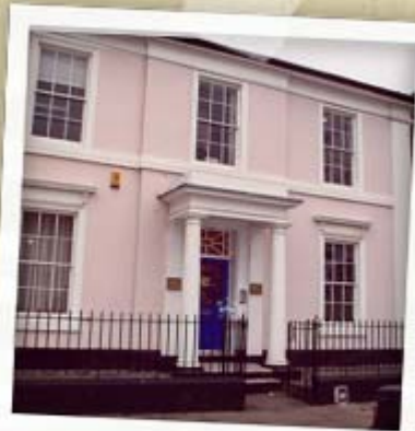
Toomey Eurolease Ltd

The 1st June was the day that New Crown Vehicle Leasing, based in Nottingham, joined the family to promote and extend within the East Midlands the already successful Contract Hire and Leasing facilities of the Group. New Crown Leasing with its long-held family reputation for customer care and satisfaction was seen as ideally complimentary to the Group's existing contract hire and leasing portfolio. In line with Group policy and in order to retain the family feeling Eurolease Car Contracts Ltd, a family vehicle leasing business in Derby, was acquired in November this year and re-named Toomey Eurolease Ltd, bringing a substantial fleet of leased vehicles into the portfolio and together with Nottingham and Chester is increasing the UK coverage within the Group.