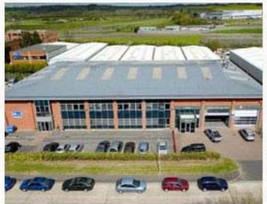
Kingston House Body Shop