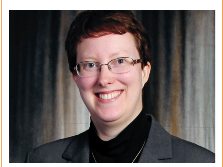
(CC-BY-SA 3.0) by Joseph C. Jones

In Argumentative Writing, students learned to write in different voices for different audiences. In learning about the specific voice on Wikipedia, they learned about the "authoritative" voice and how its tone can convince, even if the content is questionable. The ways in which tone and content reinforce and/or undermine each other is a crucial media fluency for students to learn.