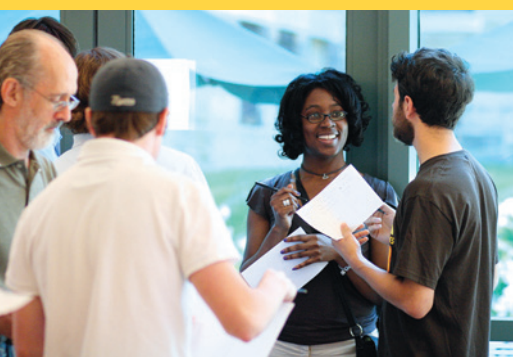
(CC-BY-SA 3.0) by Sage Ross