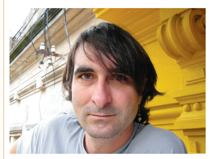
(CC-BY 3.0) by Ofelia Ros

It exceeded expectations in just about every area. I was perhaps most surprised by how much this also became an assignment about writing (and revising).