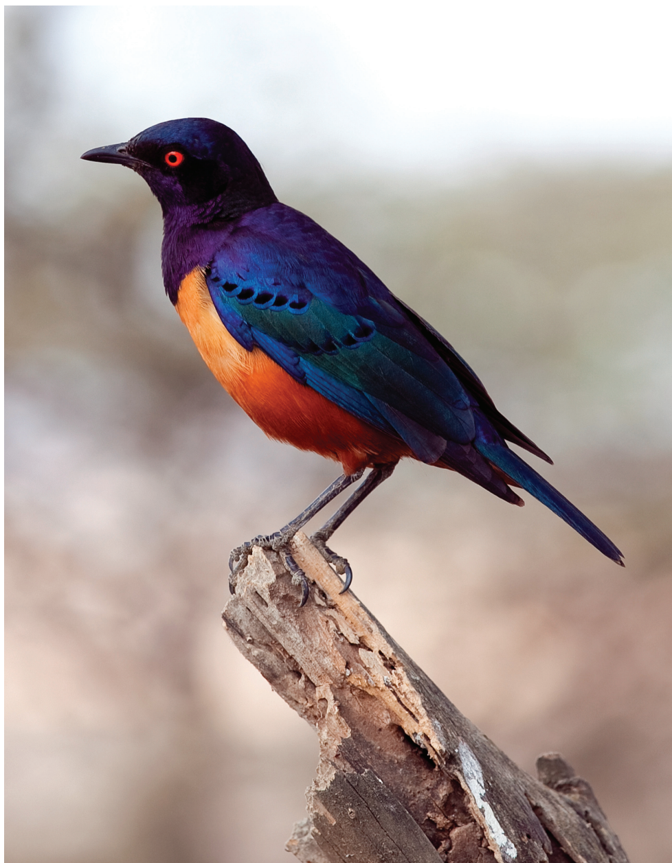
A Hildebrandt's Starling ( Lamprotornis hildebrandti ) in Tanzania

Twenty-eighth place, 2010