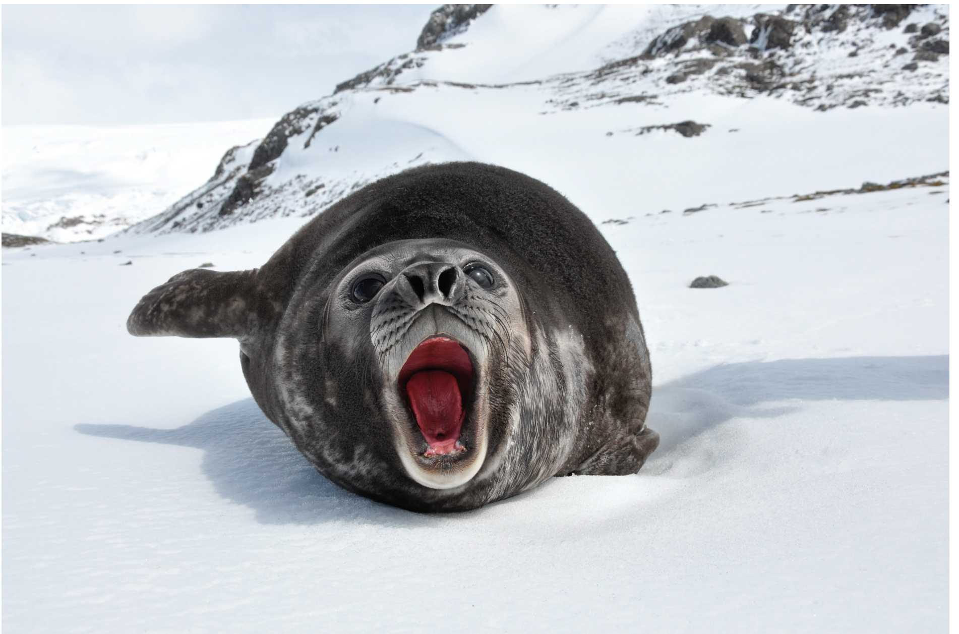
A young Southern Elephant Seal ( Mirounga leonina ) in South Georgia

Serge Ouachée (User:Butterfly austral) Fourth place, 2010 CC BY-SA 3.0 and GFDL 1.2+