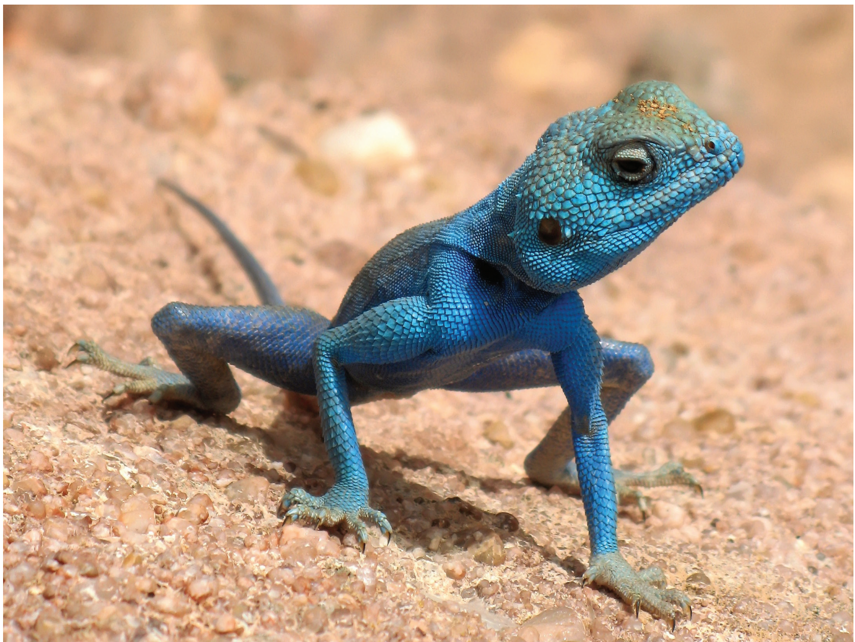
Male Agama sinaita , Jordan. This species is common in deserts around the shores of the Red Sea. While in heat, the male turns striking blue to attract females.