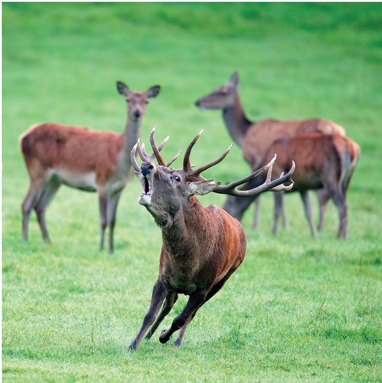
Red deer ( Cervus elaphus ), in Freyr forest, near Han-sur-Lesse, Belgium

Luc Viatour (User:Lviatour) Seventh place, 2011 CC-BY-SA 3.0