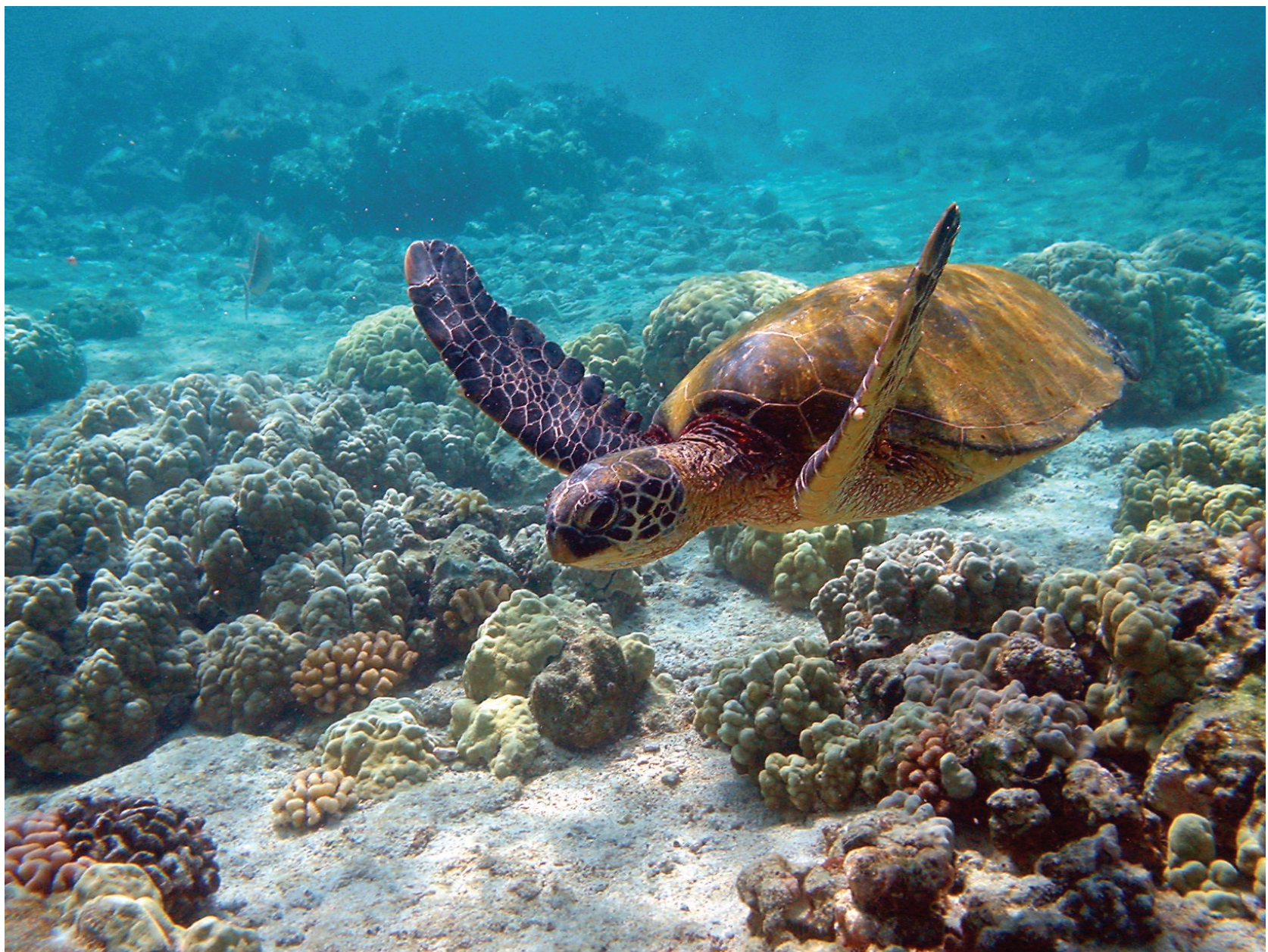
Green turtle, Hawai'i, USA

Brocken Inaglory / Mila Zinkova (User:Mbz1) Fifth place, 2007 CC-BY-SA 3.0 and GFDL 1.2+