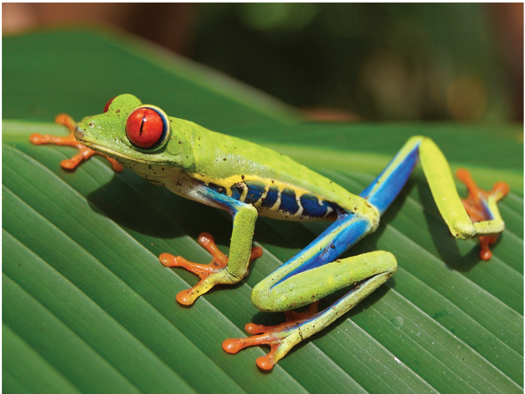
Red-eyed Tree Frog ( Agalychnis callidryas ), photographed near Playa Jaco in Costa Rica