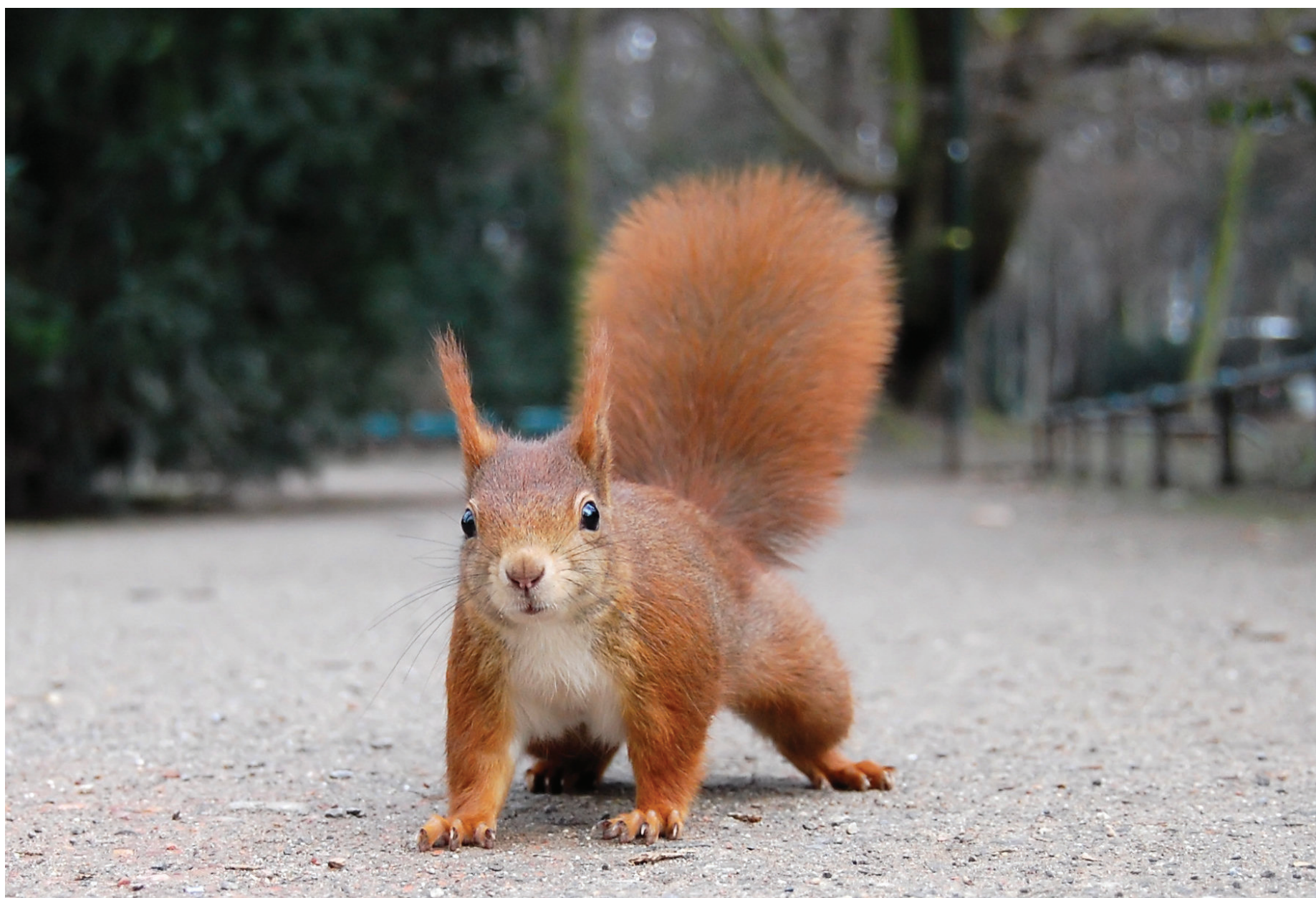
Red Squirrel with pronounced winter ear tufts in the Hofgarten in Düsseldorf, Germany

User:Ray eye Third place, 2007 CC BY-SA 2.0 DE