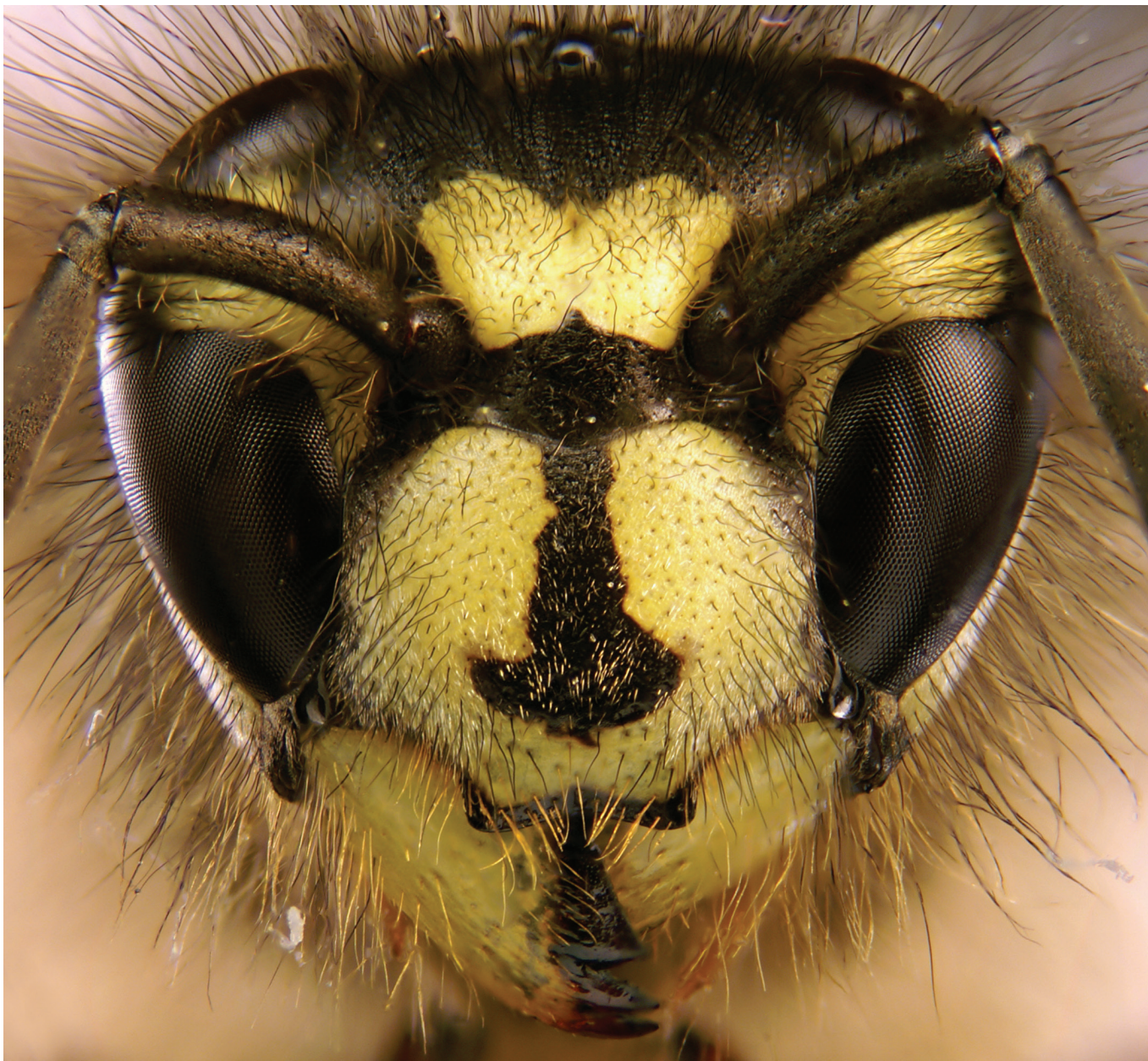
Portrait of the common wasp Vespula vulgaris depicting the characteristic head markings

Tim Evison (User:Tpe) Fourth place, 2011 CC BY-SA 2.5