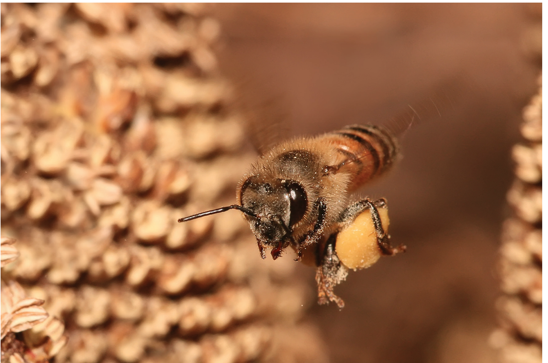
12 mm long Apis mellifera flying back to its hive carrying pollen in a pollen basket. Pictured in Dar es Salaam, Tanzania on a private facility