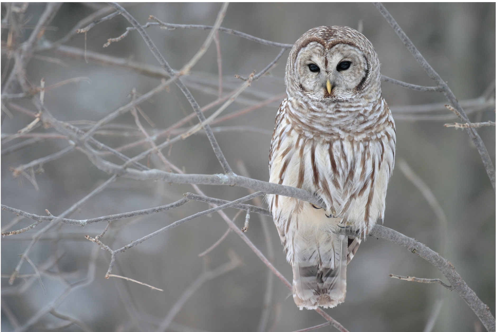
A Barred owl ( Strix varia ), photographed in Canada