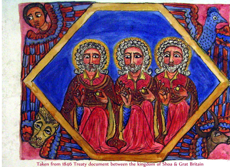
Taken from 1846 Treaty document between the kingdom of Shoa & Great Britain