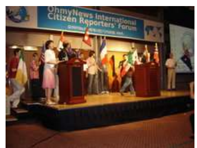
OhmyNews citizen reporters holding their national flags in a ceremony on Friday evening.

The project is sponsoring the forum in order to promote its English edition, officially launched in May 2004. Citizen reporters writing in English exchange ideas and stories, and try to understand the inner workings of the Korean edition. The conference is sponsored by Korean corporations such as Samsung, SK Corporation, LG, Yuhan-Kimberly, and Asiana Airlines.