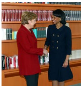
U.S. Secretary of State Rice meeting with German chancellor Merkel