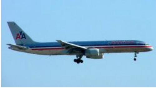
An American Airlines Boeing 757