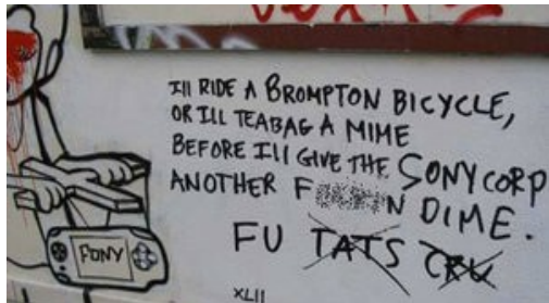
Defaced Sony graffiti advertisement

A new advertising campaign in USA for the Sony PSP which looks like graffiti and is often sprayed on previously vandalized walls has come under attack from other graffiti artists. A collective group of graffiti artists and street artists are now banding together, vandalizing the look-alike graffiti advertisements. The campaign has offended a lot of graffiti artists and street artists, drawing responses like "keep your desperate corporate long arm out of a movement that is the only thing that is ours!"