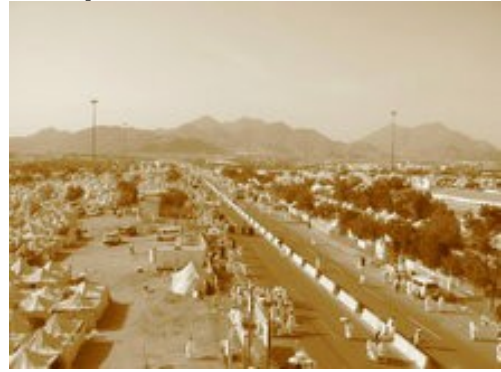
The Plains of Arafat on the day of Hajj

According to the Saudi Interior Ministry over 345 Muslim pilgrams have been killed in a stampede during the annual Hajj pilgrimage near Meeca.