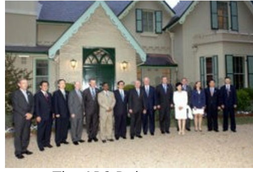
The AP6 Delegates, at Government House, Sydney. January 2006

World's biggest polluters won't cut back on fossil fuel