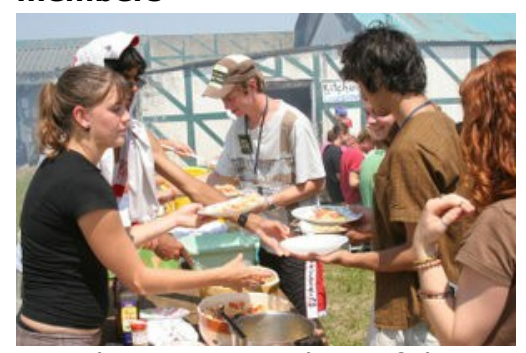
About 450 members of the Hospitality Club gathered in the village of Monnai, France, for the annual "summer camp".

The Hospitality Club became the first hospitality exchange network to pass the 100,000 members closest competitors, CouchSurfing and GlobalFreeLoaders, have 40,000 and 30,000 members.