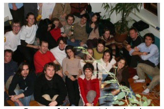
Some of the most involved volunteers gathering in Brussels to discuss the evolution of the organisation.

The most often mentionned drawback of the system is lack of security. The main difference between hospitality exchange networks and other social networking platforms such as Orkut or LiveJournal is that the former's ultimate objective is to allow for face-to-face meetings. Users should realise that there is a risk involved, although according to Frenchman Jean-Yves Hégron, main software developer of the Hospitality Club, "By using the Club you have the same level of risk as the one you face whenever you get out from your home."