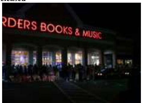
Crowds line up outside a Borders bookstore in Delaware. USA

Harry Potter and the Half-Blood Prince by J.K. Rowling was released today to hundreds of special midnight parties at bookstores. The book is expected to sell tens of thousands of copies in the first hour, and the waves of fans just keep on coming. As midnight spreads across the Atlantic and the North American continent, more and more stores will start selling.