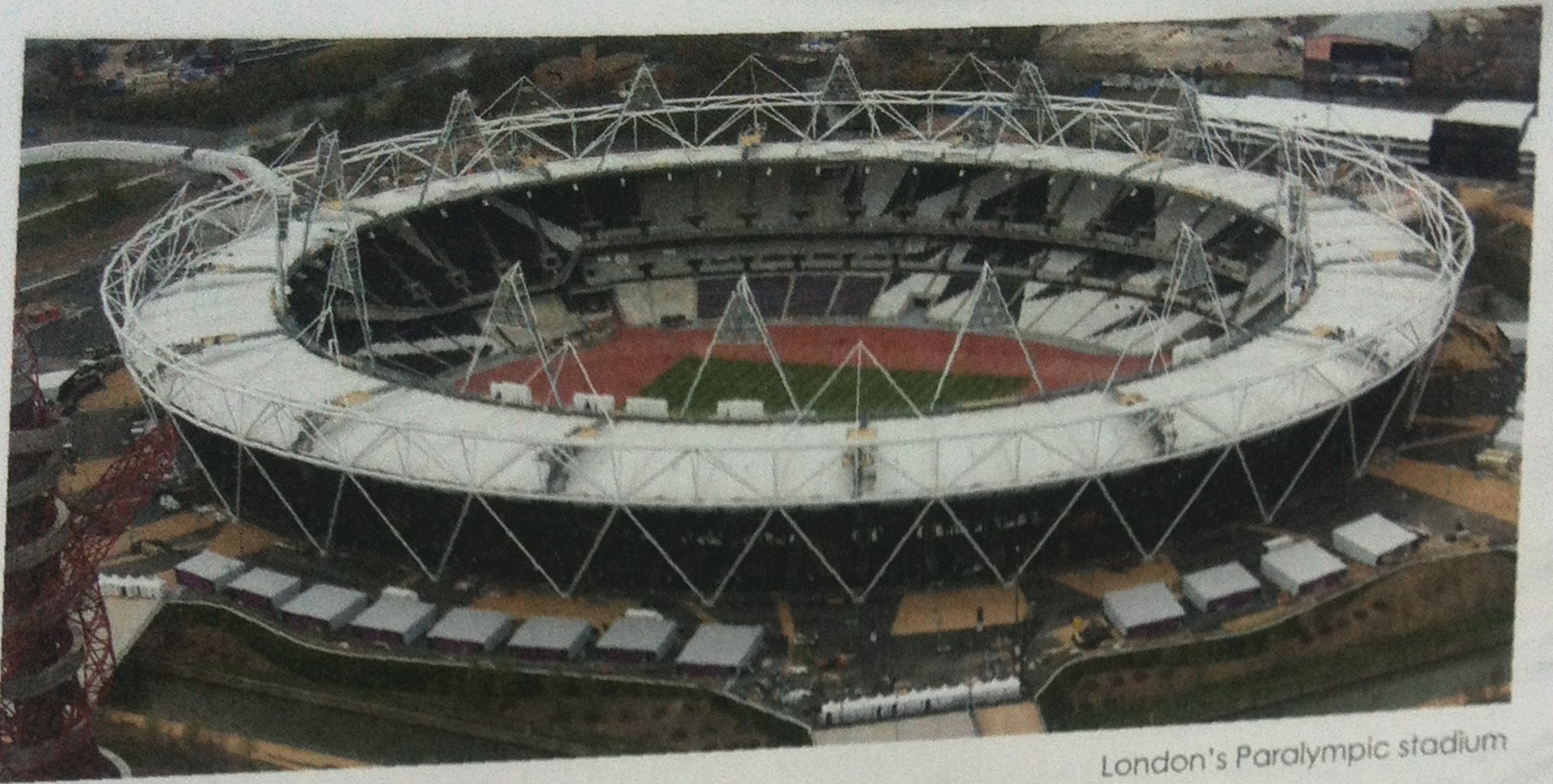
London's Paralympic stadium