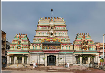
Dharmaraya Swamy Temple in Bangalore

Under the GNU Free Documentation License, Version 1.2 license. Image credit to Muhammad Mahdi Karim