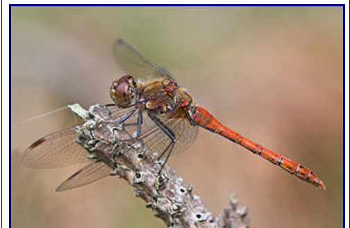
Male Common Darter ( Sympetrum striolatum ) in the Spangener Heide, part of the nature reserve Cuxhavener Küstenheiden, northern Lower Saxony, Germany.