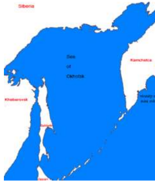
The mini sub is trapped off the south-eastern coast of the Kamchatka Peninsula

The Interfax news agency is reporting that a Russian minibus that was stranded underwater in the Pacific Ocean is trapped by two 60 tonne anchors.