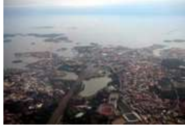
View of Helsinki

The Finnish police isolated the ports of Katajanokka and Länsisatama on Saturday. The ports were isolated at around 9.30 p.m. local time and the isolation was called off at around 11.30 p.m.