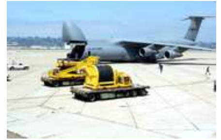
A C-5 Galaxy is loaded with people and equipment from the Deep Submergence Unit, Naval Base Coronado. The C-5 is bringing two Super Scorpio robotic rescue vehicles to Russia to assist in the rescue.

The Pacific Fleet commander says that the crew have enough food and water to survive until Monday although oxygen will run out by Saturday. The three-man submarine was designed to supply the crew with a five day supply of oxygen, however with the seven man crew the supply has been greatly depleted.