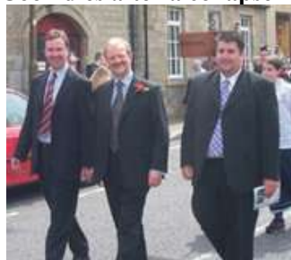
Robin Cook (middle)

Robin Cook, the former British foreign secretary and current Member of Parliament, has died after collapsing on a walk with his wife on Ben Stack hill, Scotland. Cook, aged 59, was flown to a hospital in Inverness by a rescue service helicopter half an hour after collapsing.