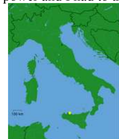
Palermo, Sicily location

The plane went into the sea after the captain asked for an emergency landing at Palermo Punta Raisi airport. When the captain realized he could not reach the airport, he was forced to land the plane at sea. The captain Chafik Garbis told Ansa, "The engine lost power and I had to try to ditch."