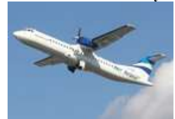
file photo of an ATR-72

A plane crash 13 km from Palermo and 12 miles North East of Capo Gallo off the Sicilian coast killed at least 14 people.