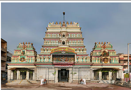
Dharmaraya Swamy Temple in Bangalore

Under the GNU Free Documentation License, Version 1.2 license. Image credit to Muhammad Mahdi Karim