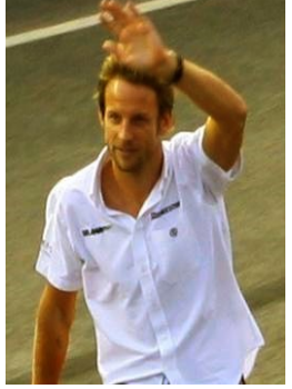
Jenson Button at Singapore. Image

yesterday's FIA Formula One 2010 Oantas Australian Grand Prix on the Melbourne Grand Prix Circuit at Albert Park, Melbourne, Australia, Button placed fourth behind both Red Bull cars and Alonso's Ferrari, credit: public domain. but took